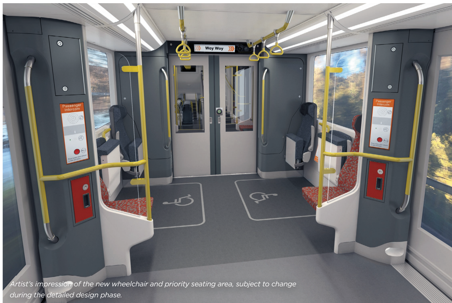
Artist's impression of the new wheelchair and priority seating area, subject to change during the detailed design phase.