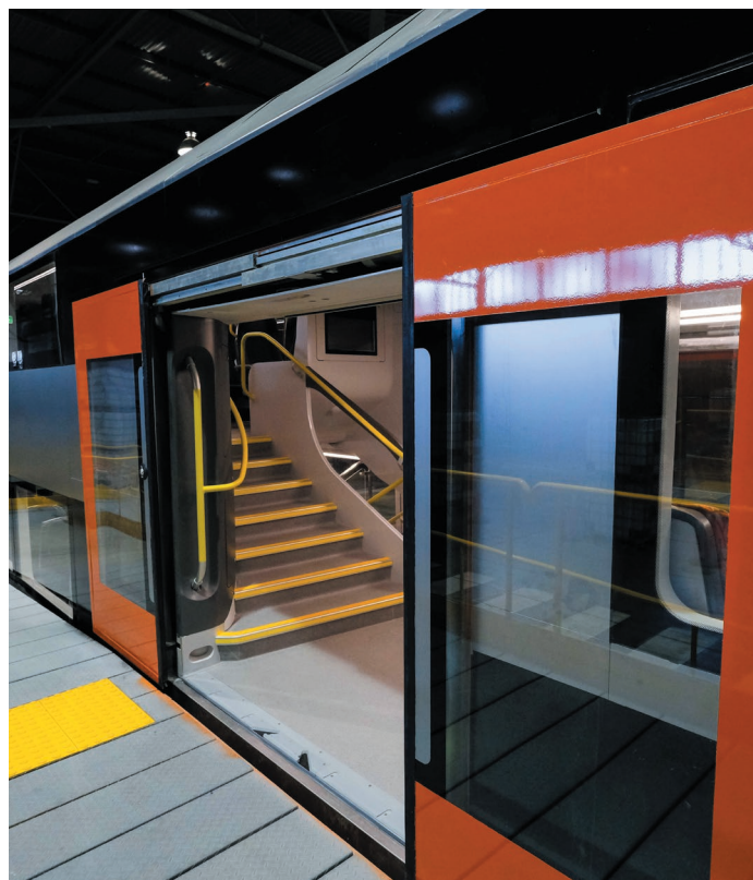
High contrast exterior doors on the life-size model of the New Intercity Fleet, subject to change during the detailed design process.

Key stakeholders are experiencing the new train in a full-scale model representing one and a half double decker carriages fitted out with the intended features. The use of the model is an important step in the project as it allows us to refine the design to ensure we deliver the best possible train fleet for our customers.