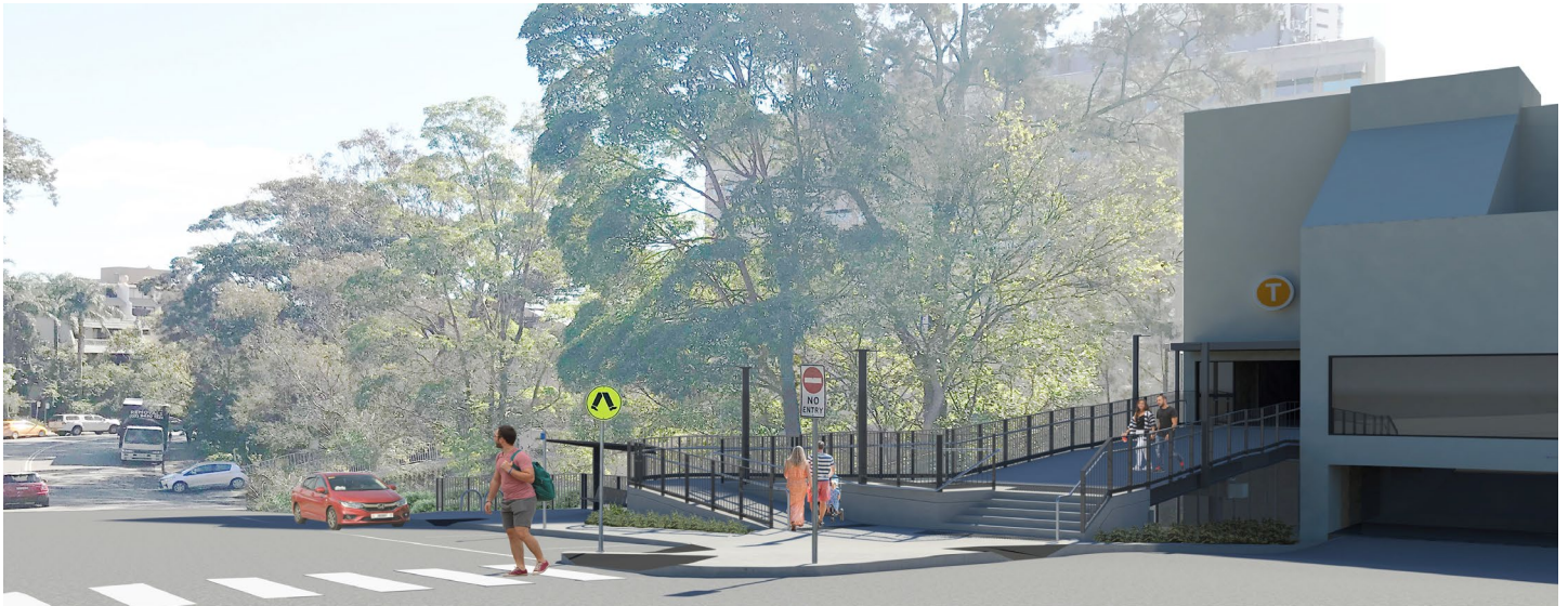
Image: Artist impression of upgrades to New McLean Street entry, including new ramp, kiss and ride and seating.

The Transport Access Program is a Transport for NSW initiative to provide a better experience for public transport customers by delivering accessible, modern, secure and integrated transport infrastructure. Last month we continued to make progress with the project, with the opening of the first set of new escalators.