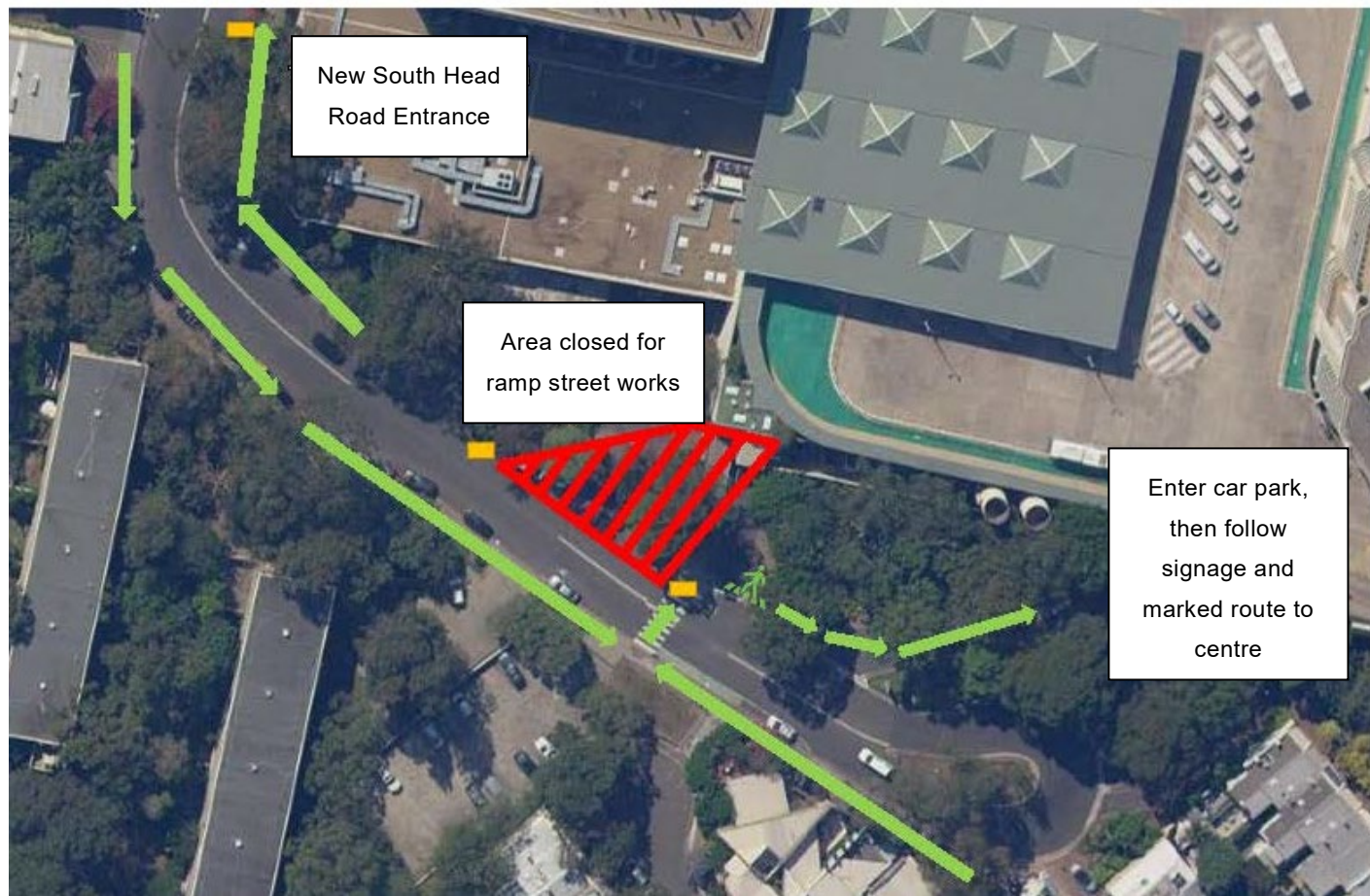
Image: New McLean Street pedestrian access diagram, during shutdown period when Edgecliff Station will not be accessible from the ramp.

The New McLean Street ramp will be closed from 20 May until 31 May 2019 . During this time, access will be available via alternate entry points, including through the car park or from New South Head Road. Signage and traffic control will be in place to assist pedestrians to safe pathways during construction.