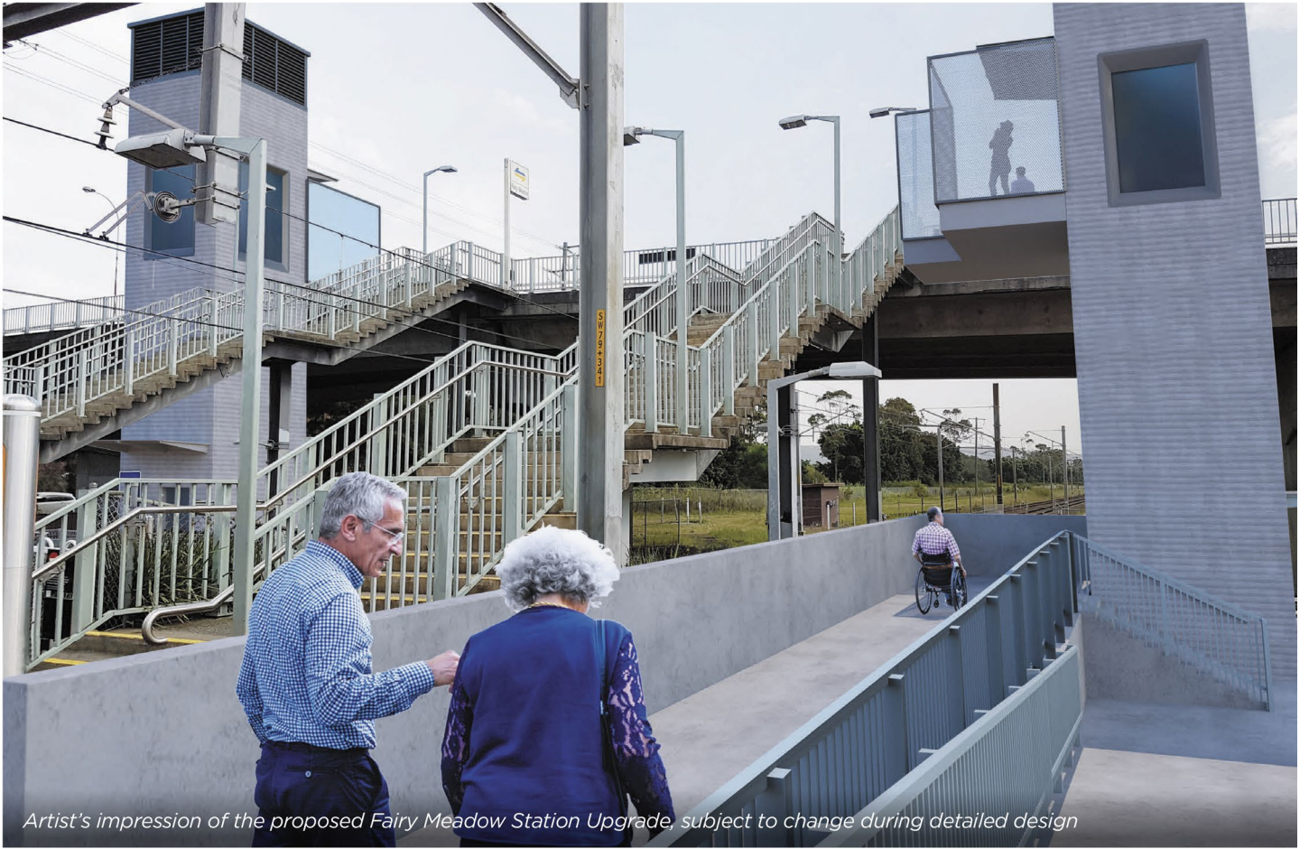
Artist's impression of the proposed Fairy Meadow Station Upgrade, subject to change during detailed design