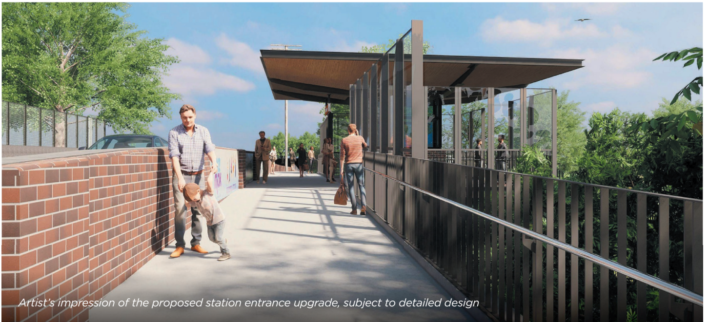
Artist's impression of the proposed station entrance upgrade, subject to detailed design