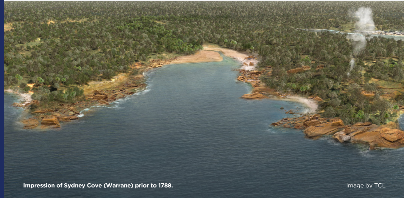
Impression of Sydney Cove (Warrane) prior to 1788.