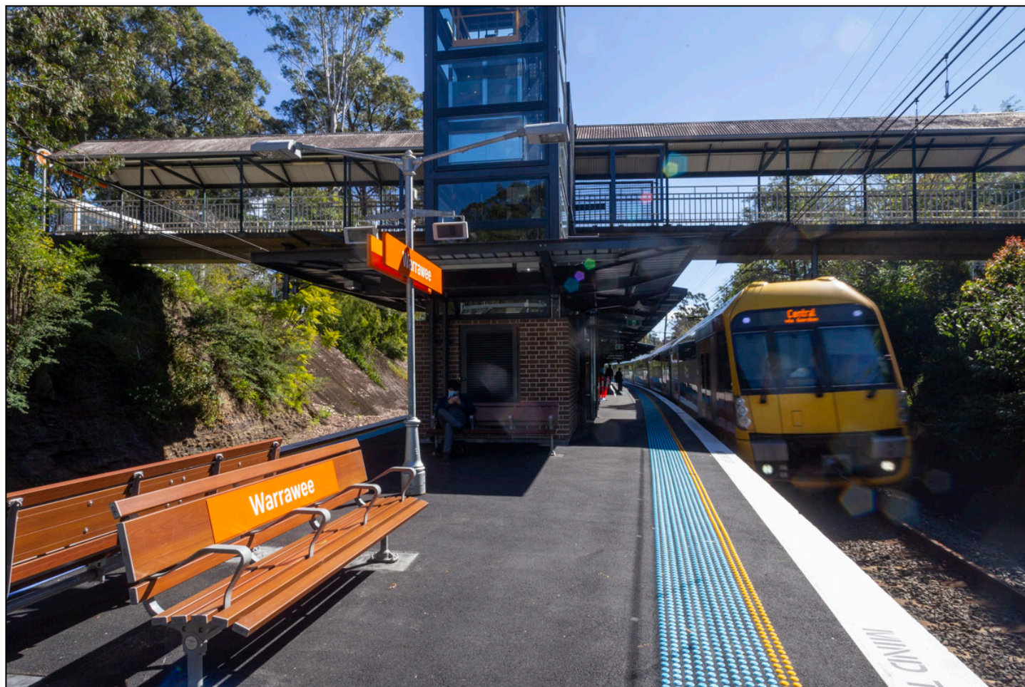
Image: The edges of the new platform surface at Warrawee Station feature approximately 64,000 tactile indicators that were installed by hand! Also pictured, a new canopy over the boarding assistance zone.