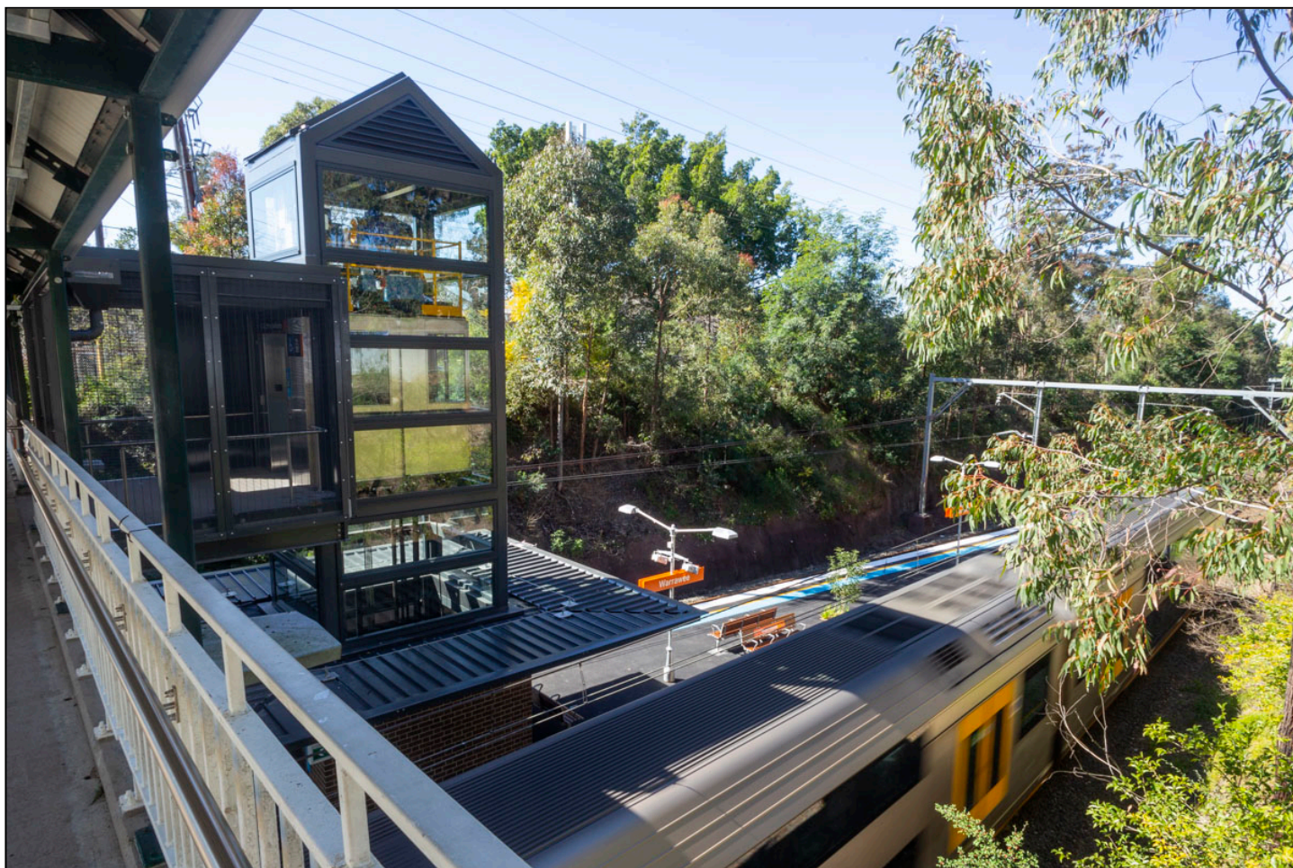
Image: Lift from the footbridge to the platform, view from the footbridge (Heydon Avenue).

This work will be low impact and it is not expected to create disruptive noise or vibration.