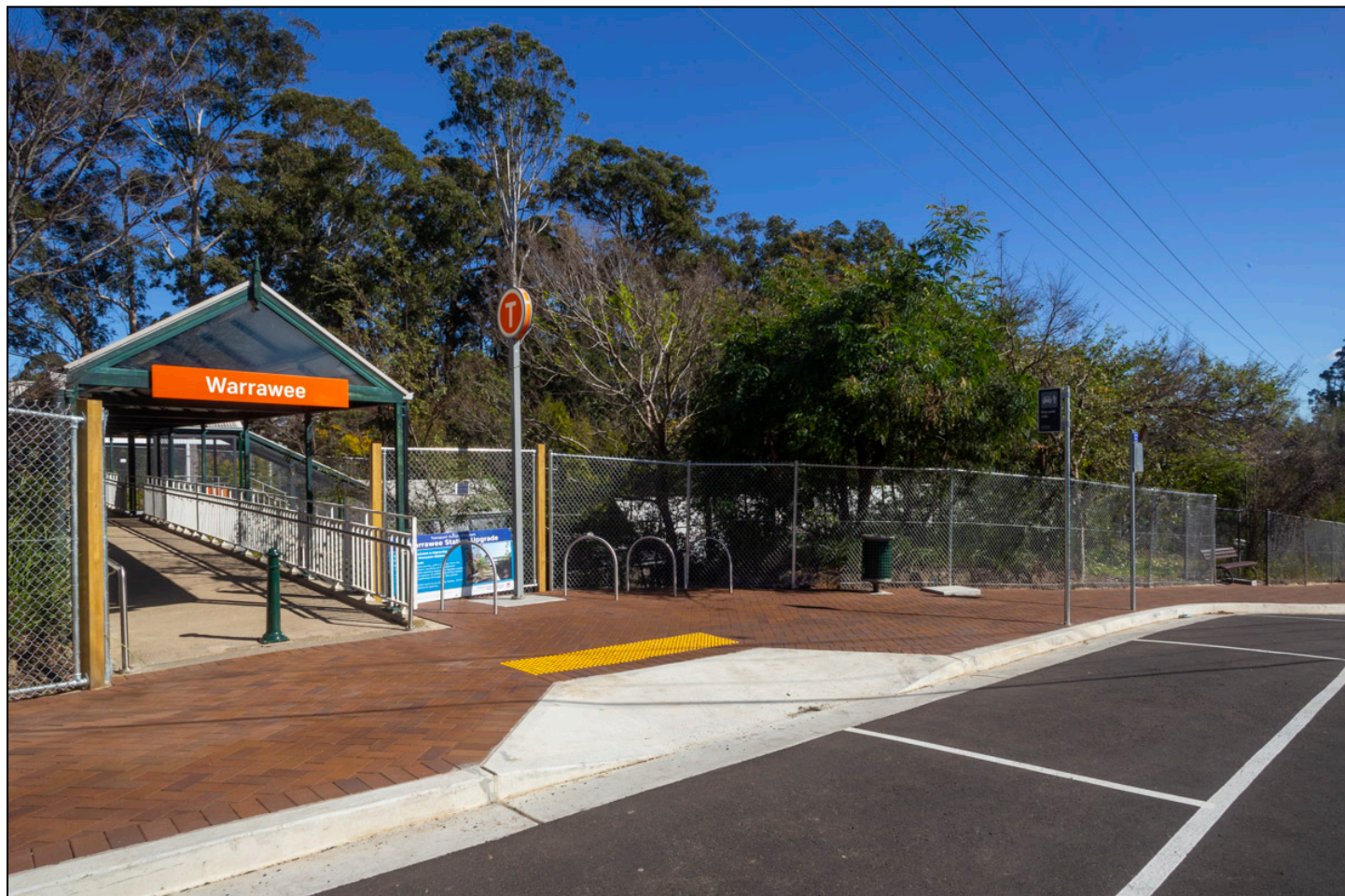
Image: New accessible pathways to the station and four new kiss and ride spaces on Warrawee Avenue.