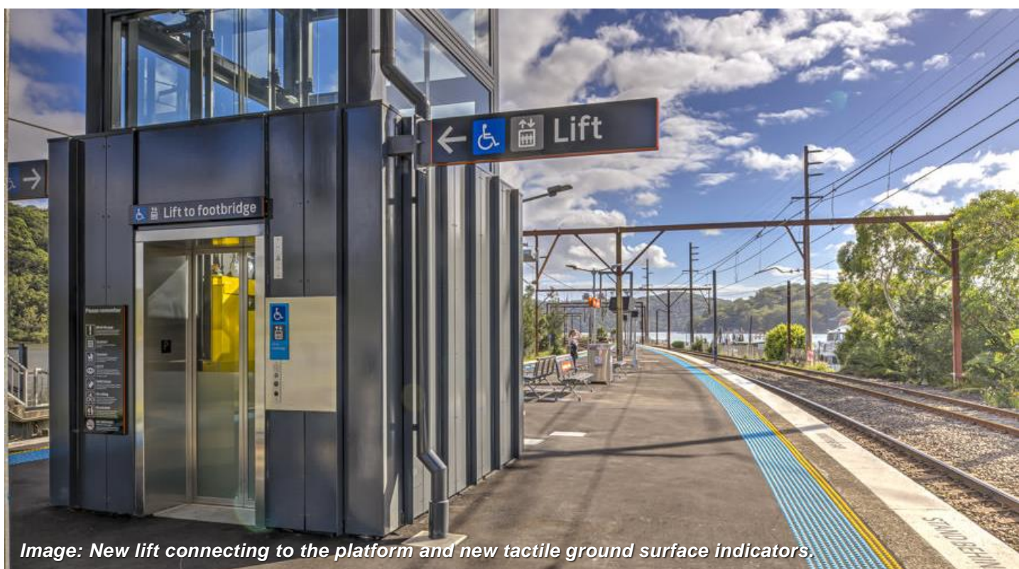
Image: New lift connecting to the platform and new tactile ground surface indicators.