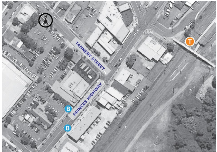
Alternate bus stops on Princes Highway for north and south bound buses.

From 13 December 2021 , the Premier Illawarra bus stop on Berkeley Road (West) will be relocated to Princes Highway. Signage and announcements to all customers will be provided by Premier Illawarra. Signage showing the pedestrian route from the relocated bus stop to the station will also be in place.