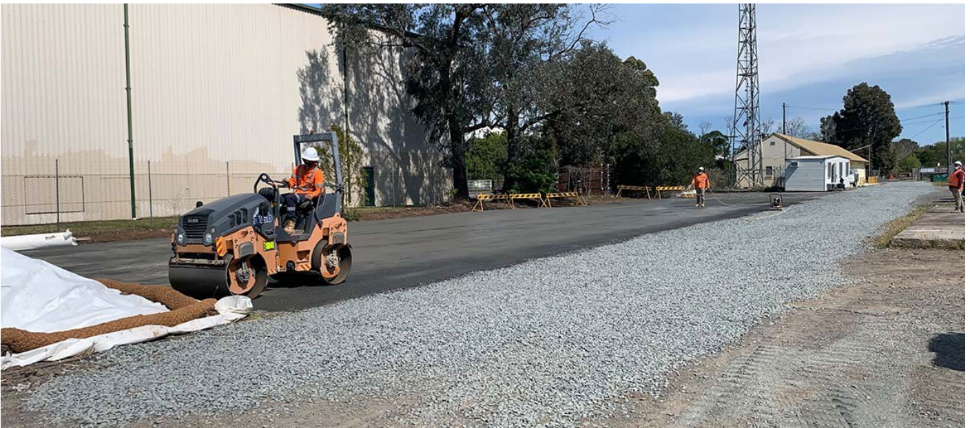
Site compound being prepared for site sheds and staff amenities.

The NSW Government is improving accessibility at Unanderra Station. This upgrade will be delivered as part of the Transport Access Program, an initiative to provide a better experience for public transport customers by delivering modern, safe, and accessible infrastructure.