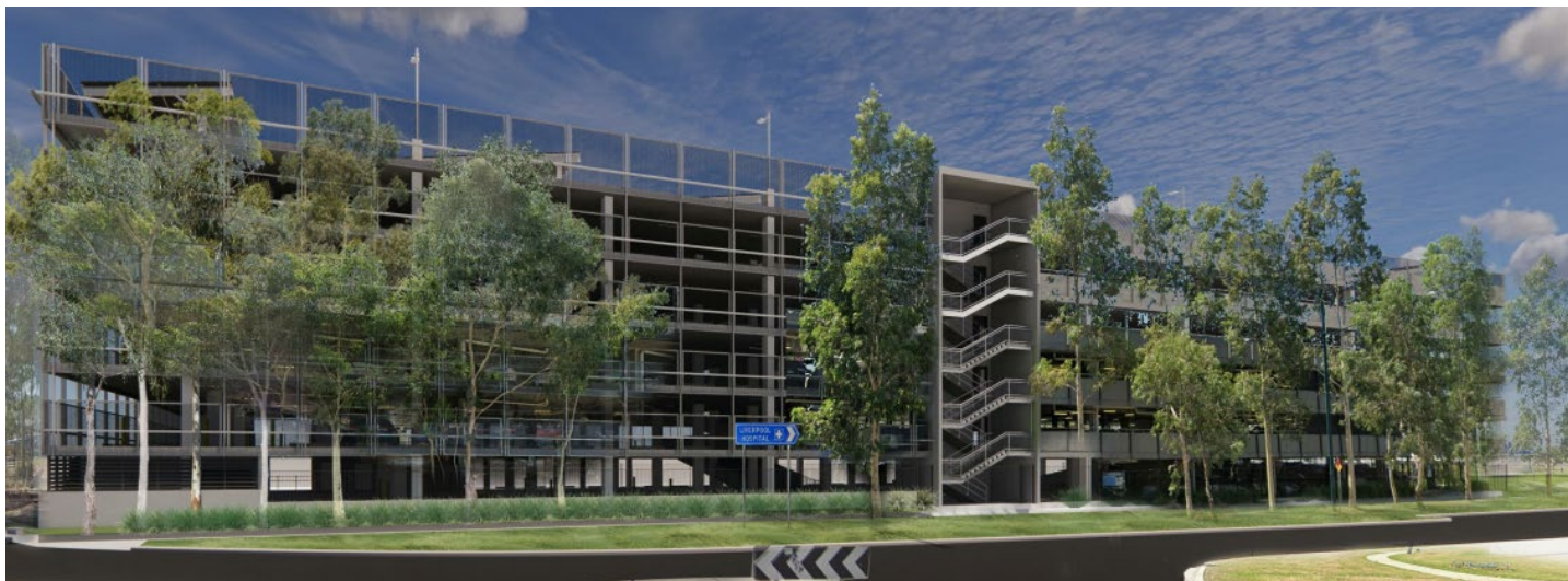
Artist's impression of the additional parking at Warwick Farm Station, subject to detailed design

Transport for NSW is constructing additional commuter parking at Warwick Farm to provide the community with more convenient access to public transport and reduce congestion on our roads.