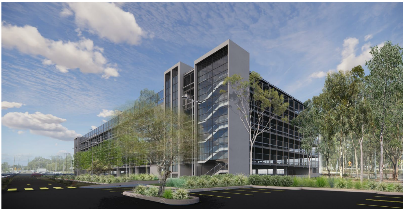
Artist's impression of the additional parking at Warwick Farm Station, subject to detailed design

Transport for NSW is constructing additional commuter parking at Warwick Farm to provide the community with more convenient access to public transport and reduce congestion on our roads.