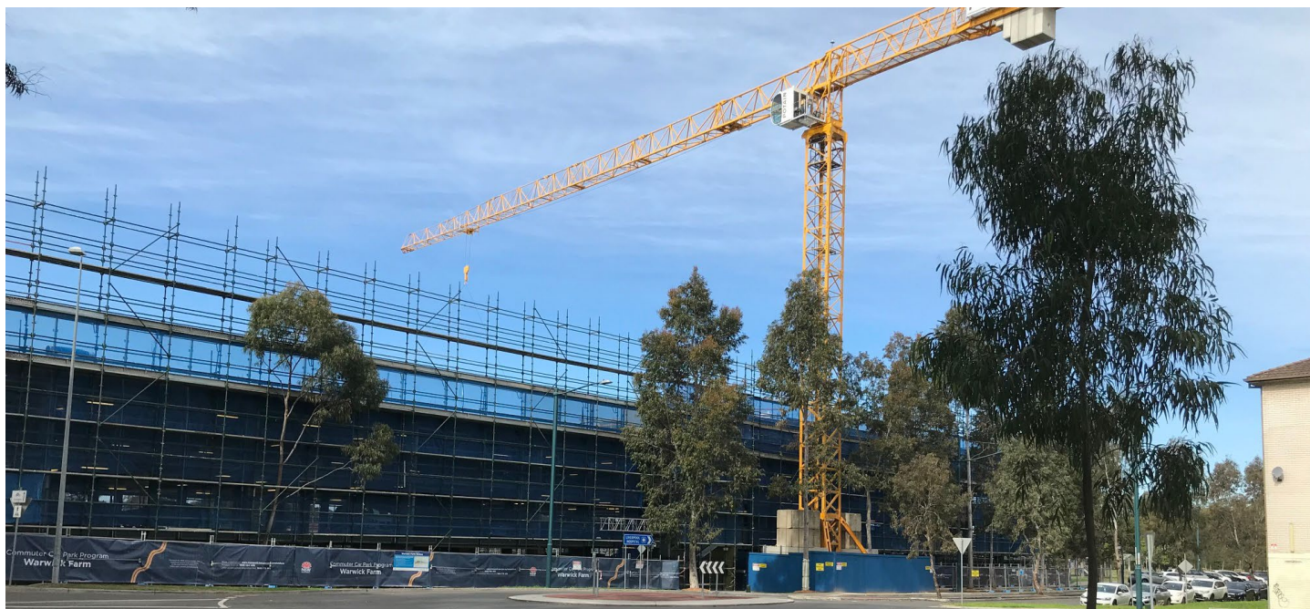
Photo above: Work has started Warwick Farm Station – scaffolding and the tower crane are in place.

Transport for NSW is delivering additional commuter parking at Warwick Farm to provide the community with more convenient access to public transport and reduce congestion on our roads. The project includes adding two levels to the existing multi-storey commuter car park to provide approximately 250 additional commuter parking spaces. Construction of the additional levels is now underway, and is expected to be open to commuters in early 2022.