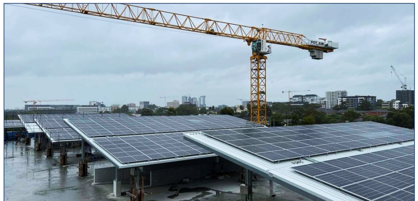
Photo above: solar panels being mounted above the new Level 5 of the Warwick Farm multi-storey car park