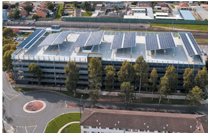
The rooftop has over 600 solar panels