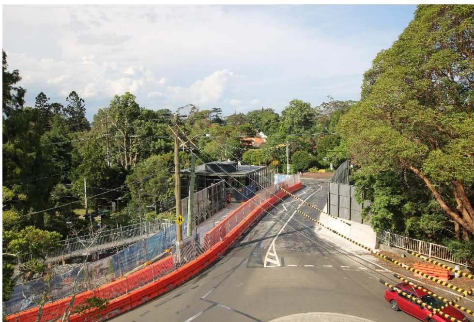
View of the new lift shaft, footbridge and lift canopy nearing completion January 2022

This work is in line with the current Public Health Orders and a COVID-19 Safe plan is in place, including masks at the station platform and QR codes.