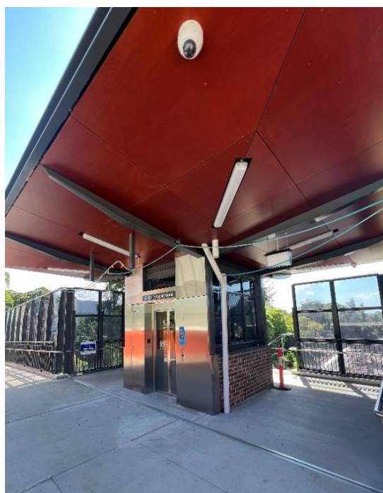
New lift structure open in February 2022

Please note some work will continue near and around the lift.