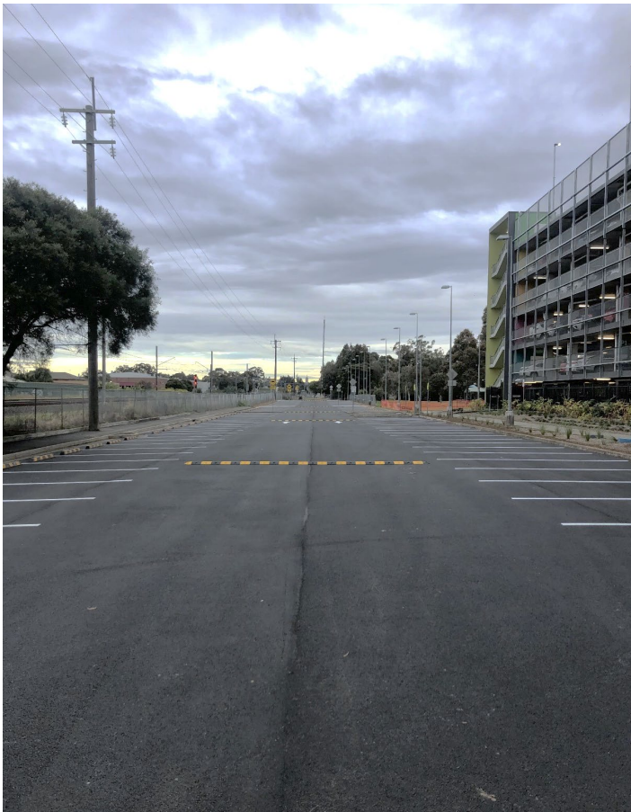
The external commuter car park at Warwick Farm Station is now open

Repair and resurfacing work on the external commuter car park is now complete. Around 150 parking spaces are now reopened for use. Thank you for your patience and understanding while we completed this important work.