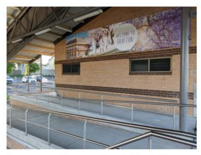
Access ramp from coach bay to the platform