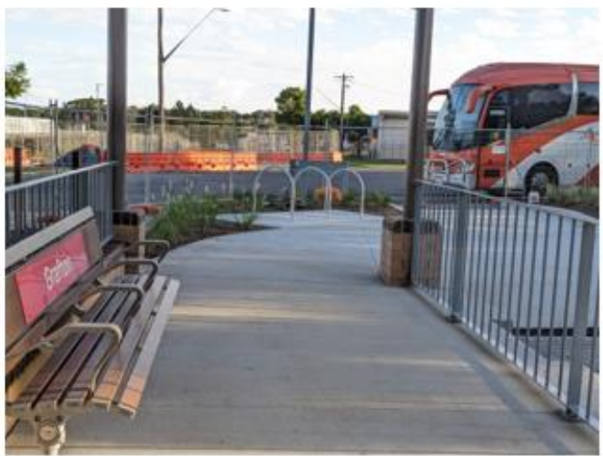
Access, seating and bike racks