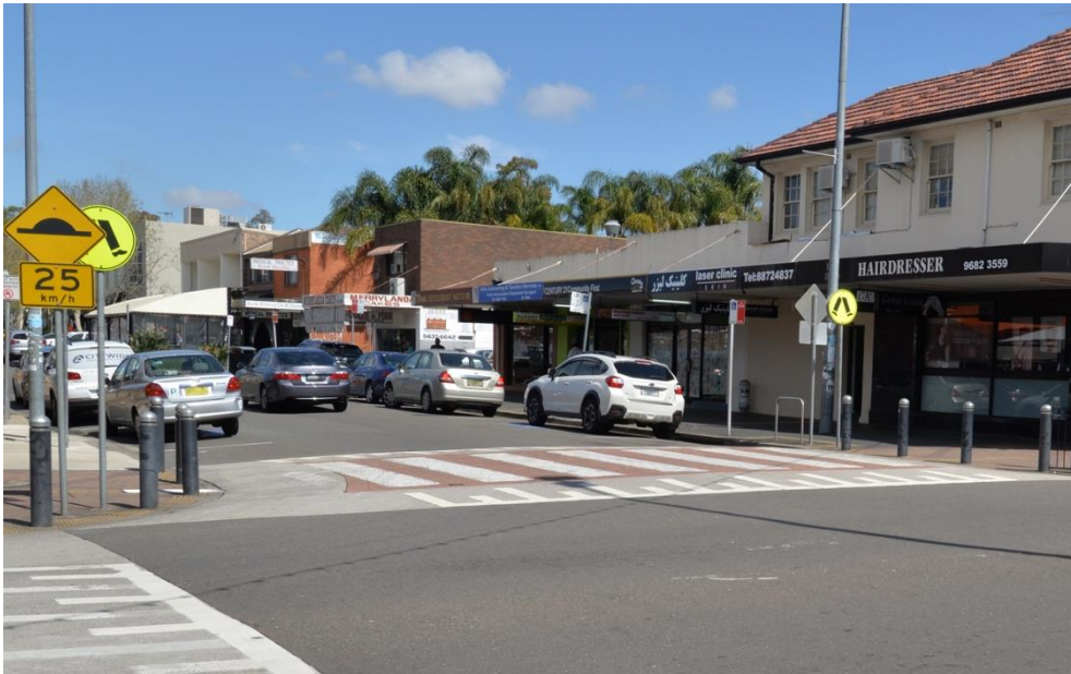
Figure 4: Merrylands – Raised platform with pedestrian crossing

A key issue investigated in the evaluation was the need for physical traffic calming devices, such as humps, linemarking or narrower traffic lanes to reinforce the 40 km/h limit (see Figures 4 and 5). The evaluation also considered which of these devices were the most effective.