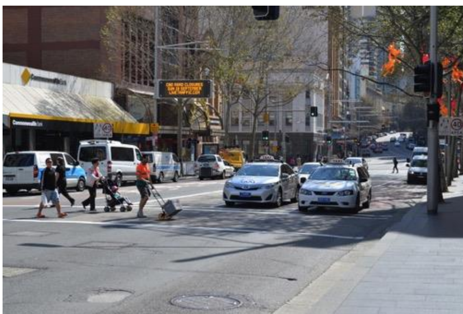
Figure 2: Parramatta – 40 km/h to improve pedestrian safety and amenity