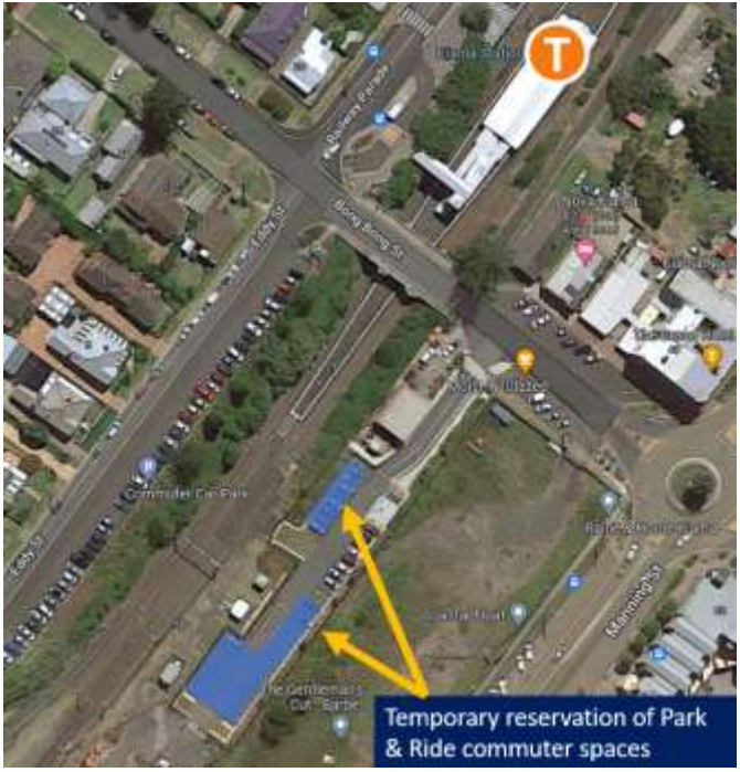
Reserved spaces indicated in blue. Kiama Park & Ride, south of Kiama Station

Wednesday 28 September and Wednesday 5 October 2022