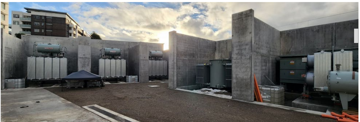
In May, the substation power transformers were delivered and placed in position for future cable connection

We will seek to minimise impacts as much as possible.