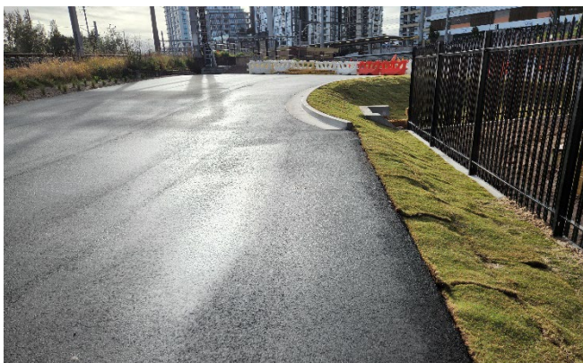
New asphalt and landscaping at the new substation

In September and October we will continue to build and fit out the new substation, and upgrade overhead wiring infrastructure at Wolli Creek Station and within the rail corridor. Additionally, the team will be installing new fencing along the rail corridor.