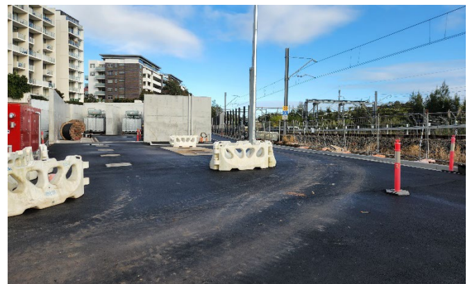
Work in progress: access road to the substation

We would like to keep you updated on our progress. To register for digital project updates, please email projects@transport.nsw.gov.au with 'Progress updates – MTMS Wolli Creek' as the subject line and include your name and address.