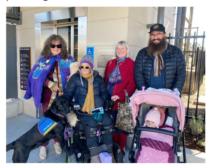
Above: Local community celebrating the opening of the Blackheath Station

Finishing work will be carried out within and around the station from 6am to 6pm on Saturday 2 September and 6am to 10pm on Sunday 3 September. Work activities including asphalting on the station platform. Tactile installation on the platform will be completed during standard construction hours 7am to 6pm Monday to Friday and 8am to 1pm on Saturdays, due to be completed by the end of September, weather permitting.