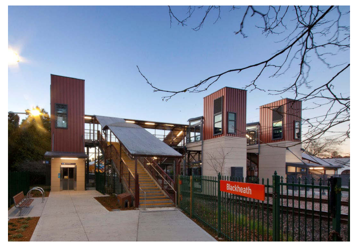
Above: New lifts to the station entries and platforms.