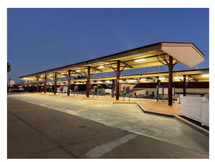
Above: Upgraded bus and coach bays with improved lighting and regraded pavement.