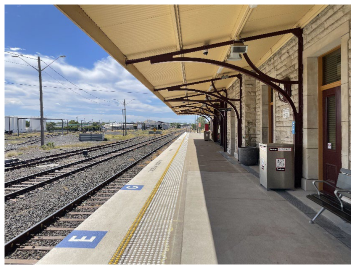
Above: Upgraded Station platform including regraded pavement, new drainage, and tactile indicators.

We hope everyone, especially customers with a disability, limited mobility, carers/parents with prams and those travelling with luggage, will have an improved experience when catching the train at Dubbo Station.