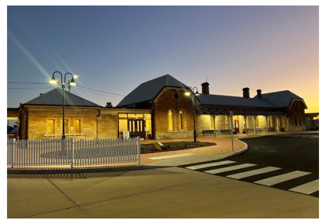
Above: Completed upgrade of Dubbo Railway Station including heritage light poles and improved wayfinding.

Dubbo residents and visitors can now enjoy not only a beautiful, historic train station, but a safer and more accessible one.