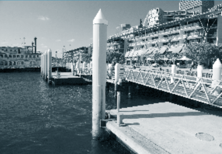
Work continued on the $1 billion public/private redevelopment of King Street Wharf on the former cargo and passenger wharves 9 and 10, Darling Harbour.