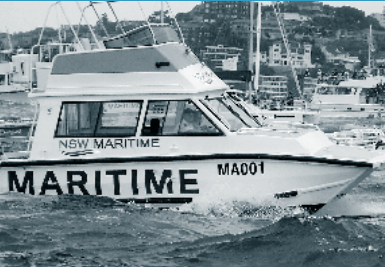
NSW Maritime is the lead agency in on-water traffic management during the major aquatic events on Sydney Harbour such as the Ferrython on Australia Day.