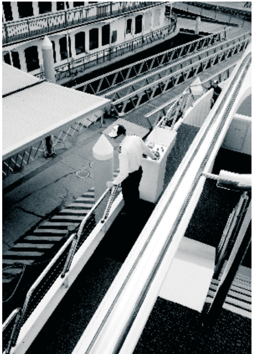
NSW Maritime provides maritime infrastructure, such as King Street Wharf (pictured above), which supports the commercial vessel industry.

A total of 115 integrated development applications were reviewed under the Rivers and Foreshores Improvement Act 1948 , representing a decrease from the 207 applications considered during the previous year. This reduction is the result of new exemptions which apply to applications within existing building footprints and almost all ancillary developments more than 10 metres from protected waters. Accordingly, the number of permits for work issued decreased from 55 in 2004–2005 to 35 for the current year.