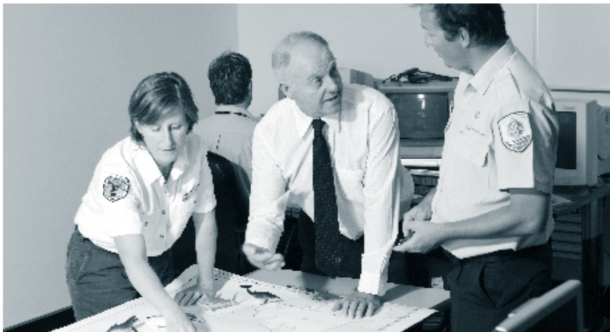
Officers from NSW Maritime and National Parks and Wildlife Service liaise regarding traffic management during whale visitations.