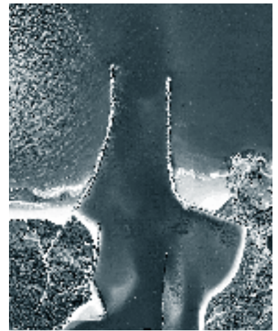
Aerial view of the entrance to the Port of Yamba which recorded a 19 per cent increase in trade tonnage handled in 2005–2006.

A review of the operating and management arrangements for the Ports of Yamba and Eden was completed in September 2005. Meetings with port stakeholders were held to discuss the review's outcomes. The matter is currently under consideration by NSW Maritime with the aim of ensuring these ports are managed appropriately.