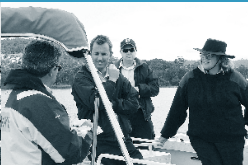
NSW Maritime plays a key role in staging the annual Sydney Harbour Week. Pictured is a scene from the Sail Expo event held in Cockle Bay.