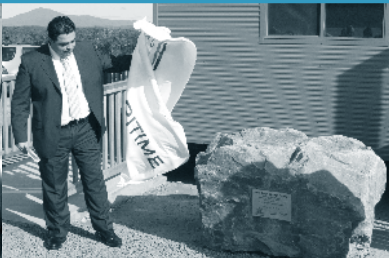
Minister for Ports and Waterways, Joe Tripodi, unveils a plaque to officially open the $4 million, 8 hectare cargo storage area at the Port of Eden in April 2006.