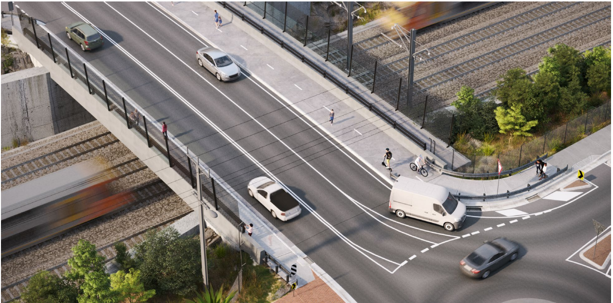
Artist's impression of upgrade at Bridge Road, Westmead