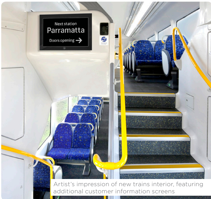
Artist's impression of new trains interior, featuring additional customer information screens