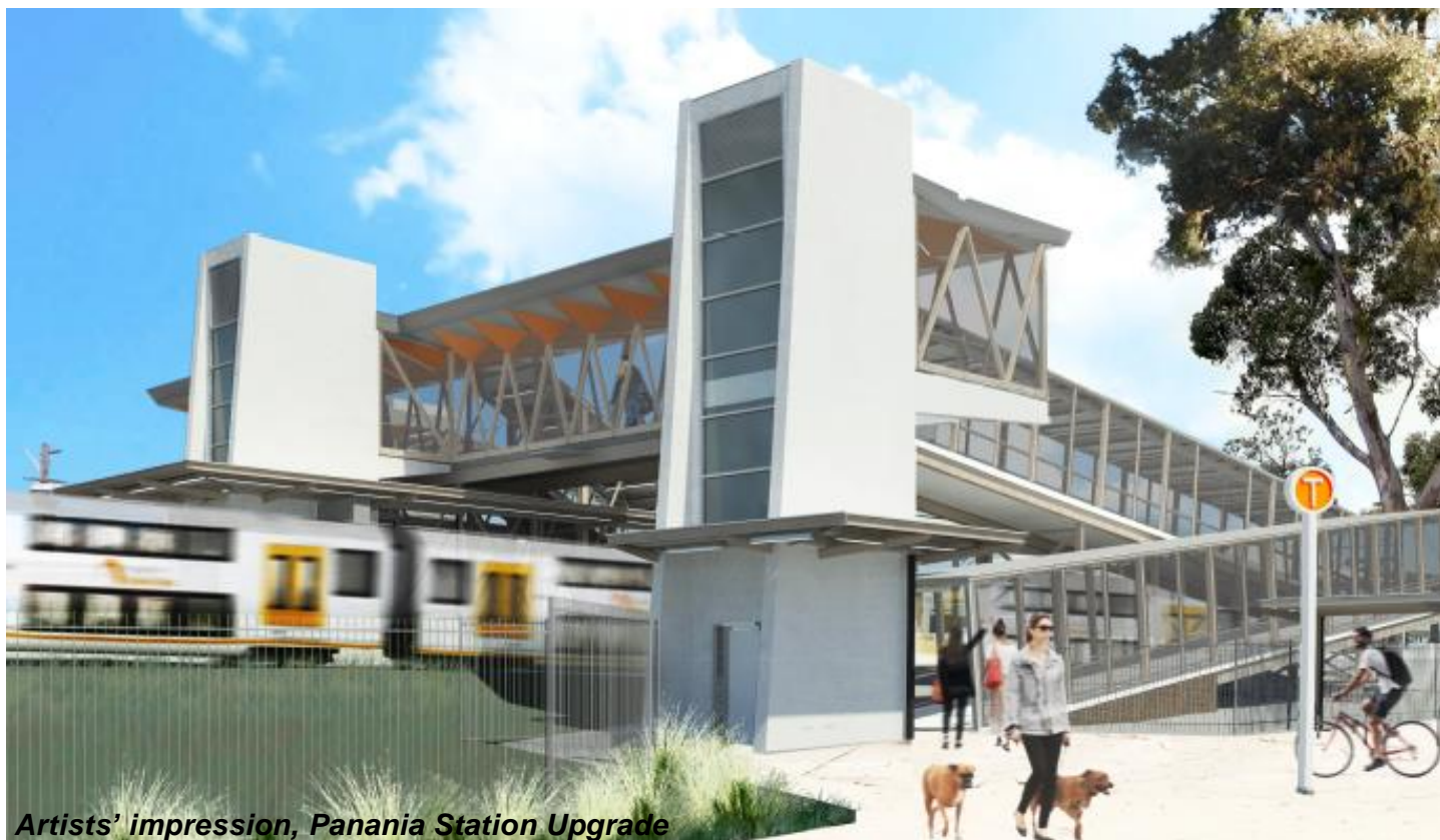
Artists' impression, Panania Station Upgrade

The Transport Access Program is a Transport for NSW initiative to provide a better experience for public transport customers by delivering accessible, modern, secure and integrated transport infrastructure.