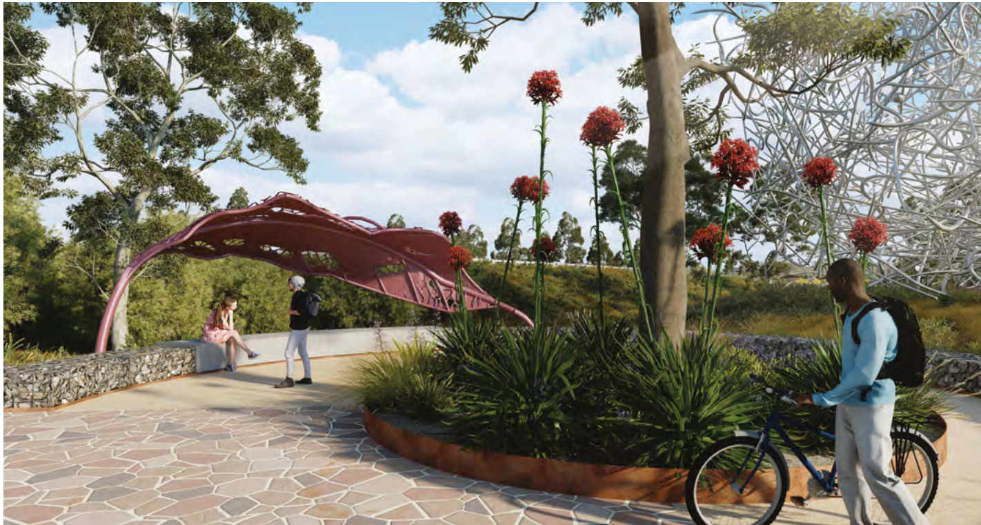
Artist impression of the Time of Burrugin multi-use space with the Great Emu in the Sky sculpture in the background

To learn more about the PDLP and what we heard, the Submissions Report is available at nswroads.work/m12motorway .