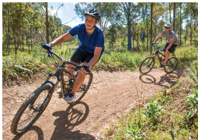
Bike trail in Western Sydney Parklands

Visit westernsydeyparklands.com.au/wylde for more information.