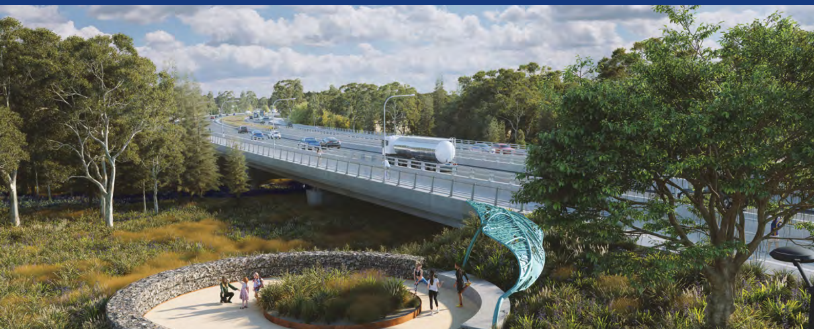
Artist impression of aerial view west over Kemps Creek and multi-use space with incorporated Aboriginal interpretation design.

The Australian and NSW governments are securing a brighter future for Western Sydney's growing residents, visitors and workers by delivering the new M12 Motorway.