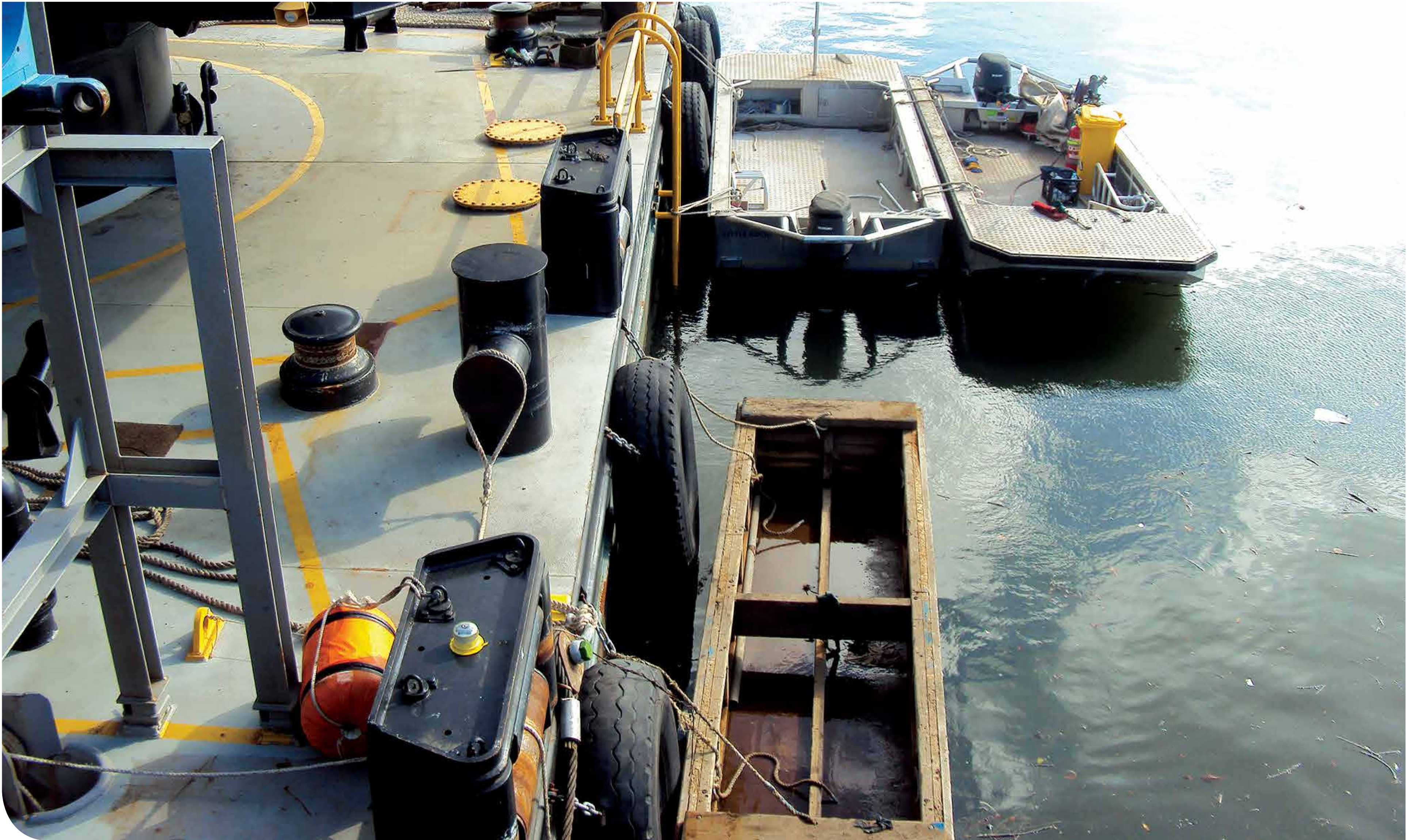
Small work boats tethered to a pontoon