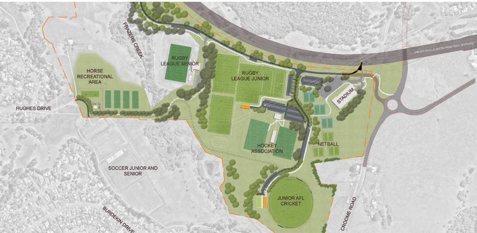
Picture of Croom Regional Sporting Complex once changes have been completed.

Roads and Maritime Services | September 2018