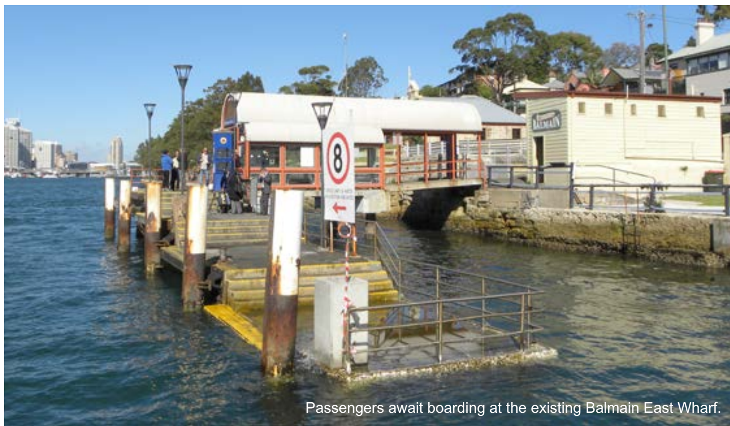
Passengers await boarding at the existing Balmain East Wharf.

We thank you for your patience during this work and apologise for any inconvenience.