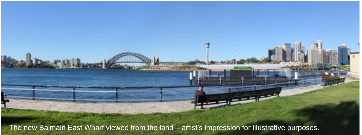
The new Balmain East Wharf viewed from the land – artist's impression for illustrative purposes.