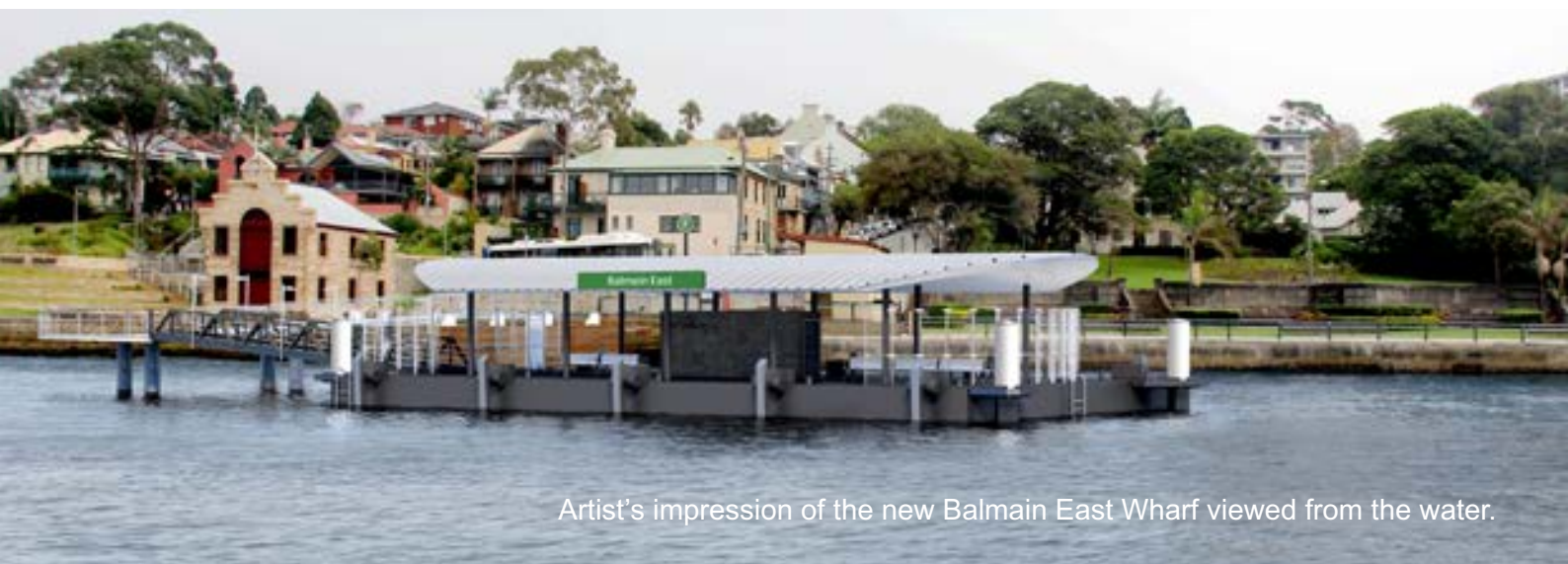
Artist's impression of the new Balmain East Wharf viewed from the water.