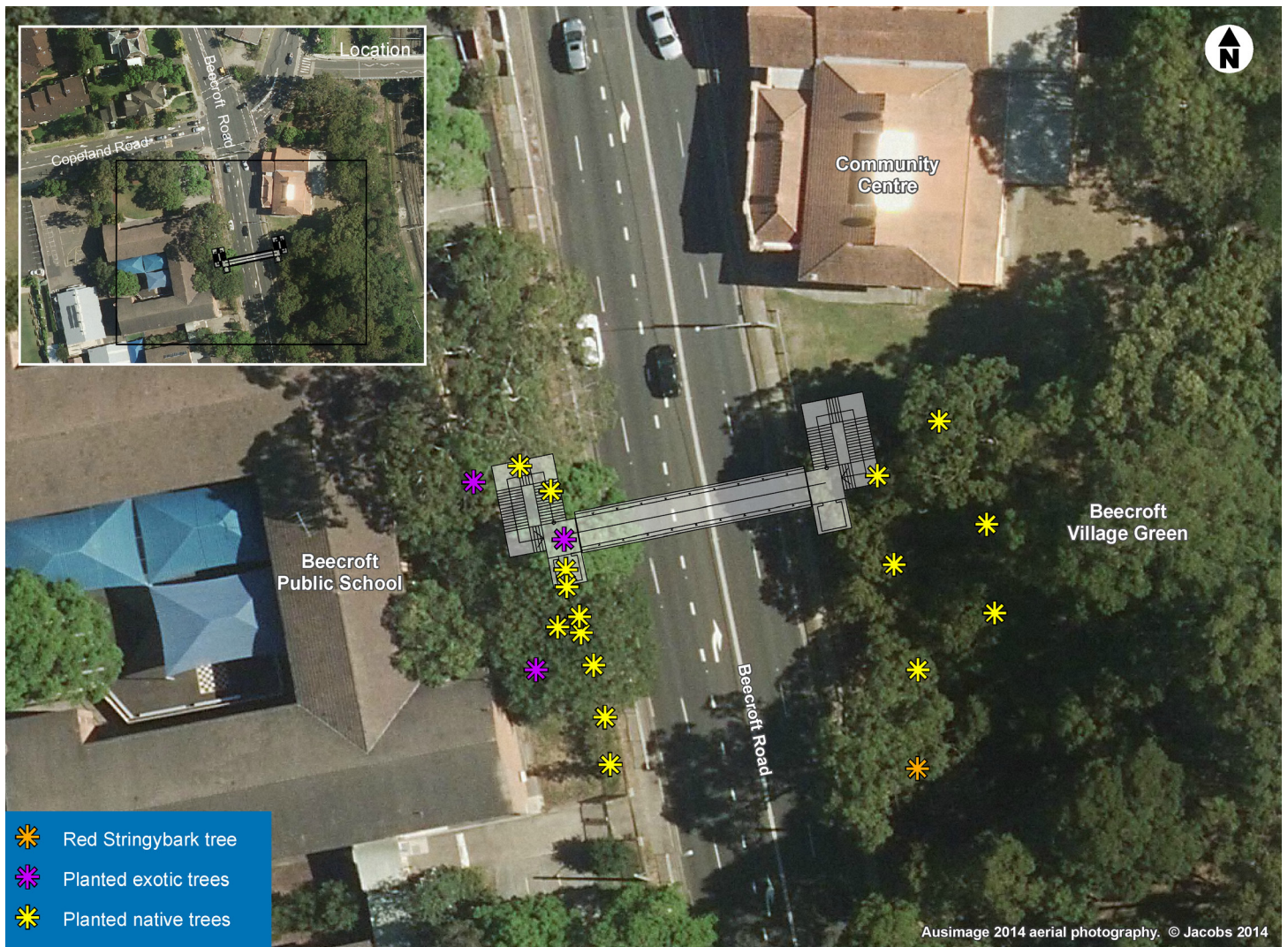
Proposed tree removal

We have provided maps to help better explain the location of the trees that we are proposing to remove.