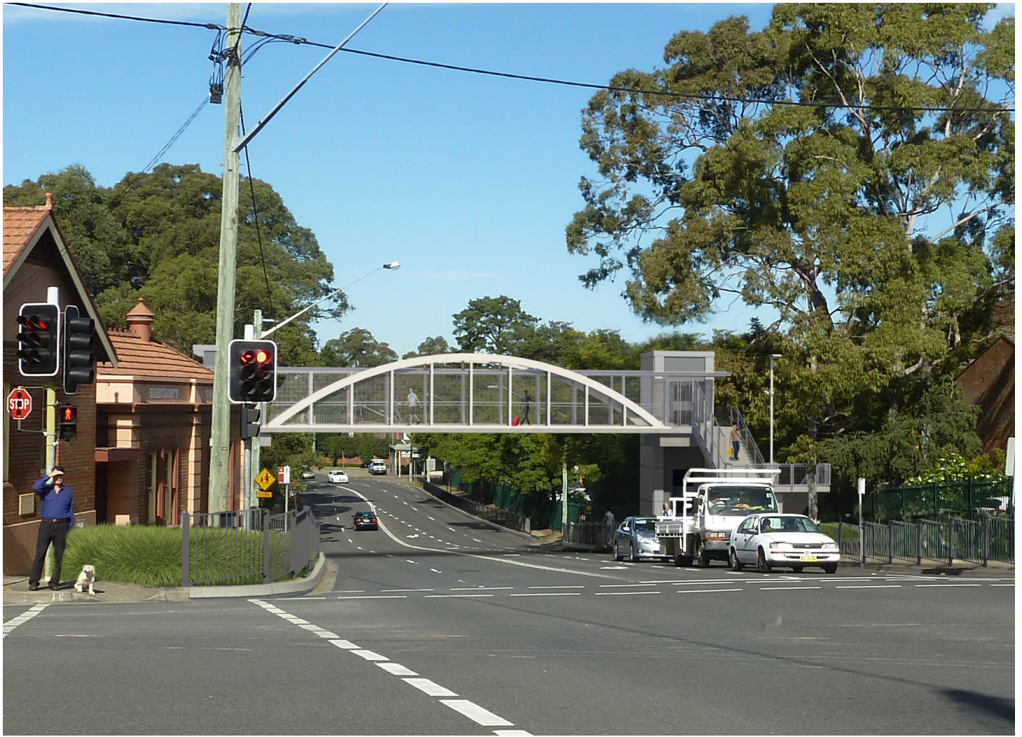
Looking south on Beecroft Road