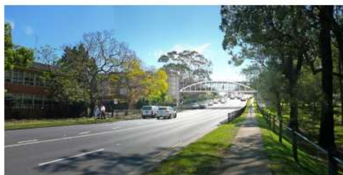
Looking north along Beecroft Road