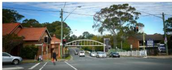
Looking south along Beecroft Road

For more information contact DownerMouchel: Phone: 1800 332 660 Email: enquiries_nsw@downermouchel.com