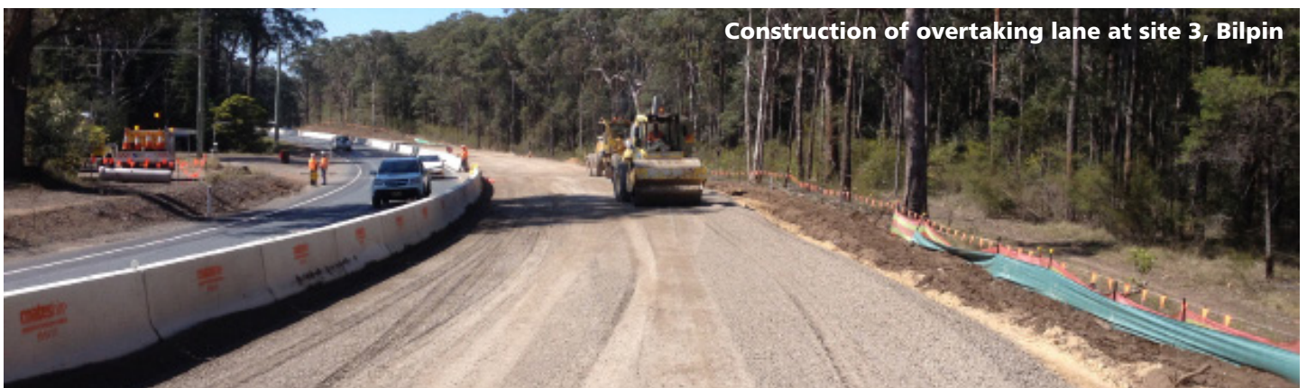
Construction of overtaking lane at site 3, Bilpin