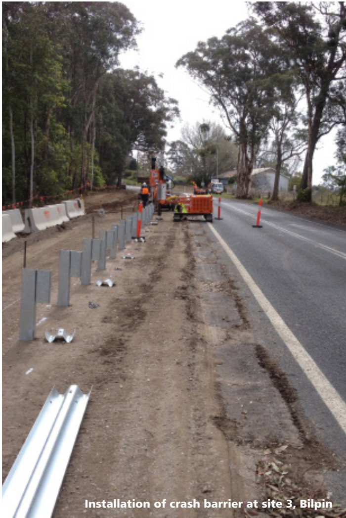
Installation of crash barrier at site 3, Bilpin