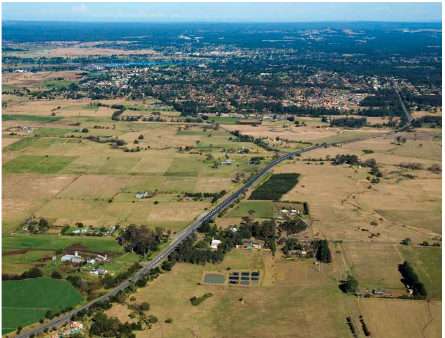
View of the Princes Highway at Meroo Meadow, looking towards Bomaderry

The NSW Government is funding the Princes Highway upgrade between Berry and Bomaderry. Roads and Maritime Services has now finalised the concept design. In recent months the project team has considered the community feedback received since the November 2013 display and incorporated it, where possible, into the final concept design.