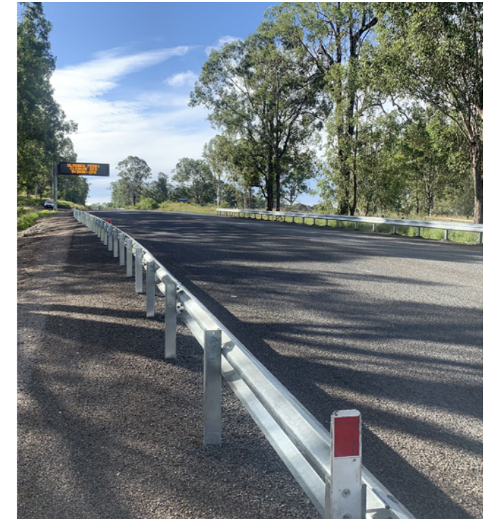
Road rebuilding including installation of a widened median and new roadside safety barrier between Reilleys Lane and Six Mile Lane currently under construction

Work is taking place on a three kilometre section of the Big River Way between Reilleys Lane and Six Mile Lane, south of Grafton. The work involves road rebuilding, widening of the road median and installation of roadside safety barrier. This work started late January and is expected to be completed by the end of June 2021.