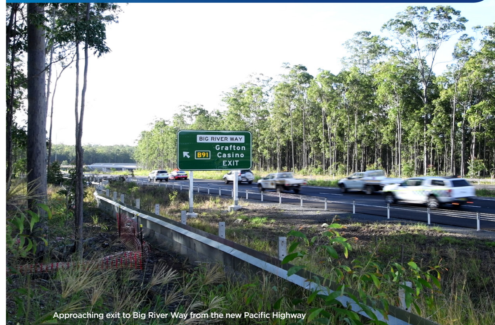
Approaching exit to Big River Way from the new Pacific Highway

As part of the NSW Government's Saving Lives on Country Roads program, Transport for NSW continues to carry out a number of safety improvements on the old Pacific Highway, now known as Big River Way, between Glenugie and Tyndale.