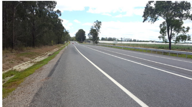
Big River Way at Bom Bom