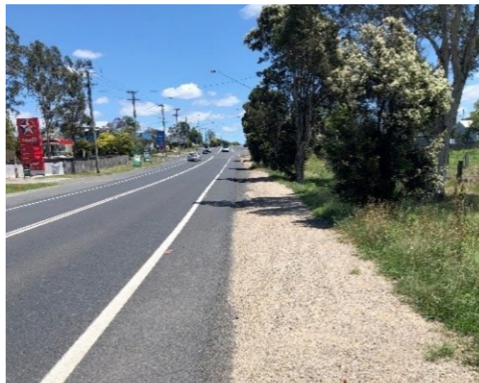
Current view of Heber Street intersection looking north