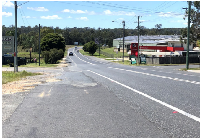
Current view of Heber Street intersection looking south

The road shoulder will be widened at this intersection to improve traffic movements. This work will take place during June and July 2021.