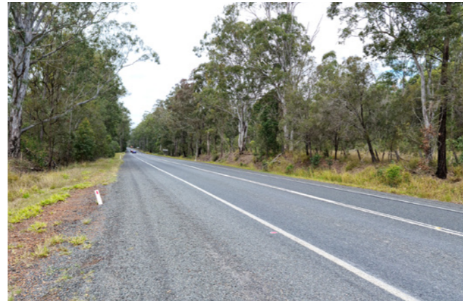
Before roadside safety barrier installation on Big River Way at Glenugie

Vegetation removal, drainage improvements and safety barrier installation took place north of Eight Mile Lane at Glenugie.