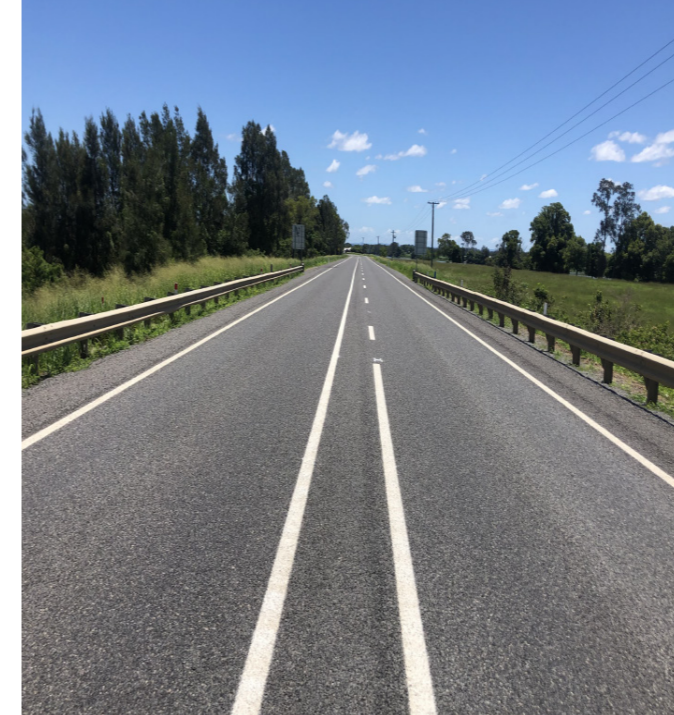
View of new pavement after road rebuilding took place at Coldstream, looking south

Road rebuilding and resurfacing has taken place along with widening the road median on a one kilometre section of road.