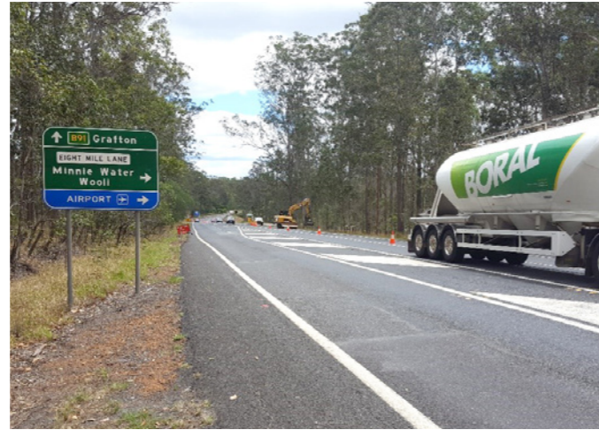
Vegetation removal at Glenugie before changes to line marking and installation of safety barrier are completed

Vegetation removal has taken place south of Eight Mile Lane at Glenugie.