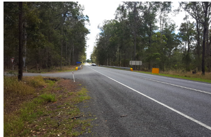
After installation of safety barrier on Big River Way at Glenugie, looking north from Dinjerra Rest Area