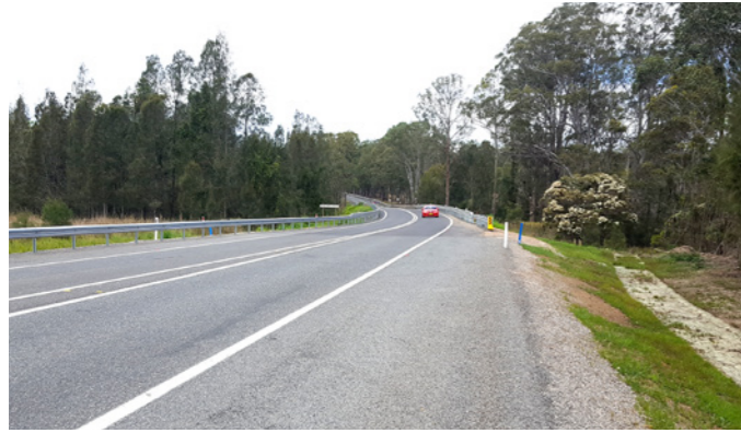
Big River Way at Bom Bom

Road rebuilding, installation of roadside safety barriers and widening of the centre median has taken place on a 1.45 kilometre section of Big River Way between Six Mile Lane and Bom Bom Creek at Bom Bom, south of Grafton.