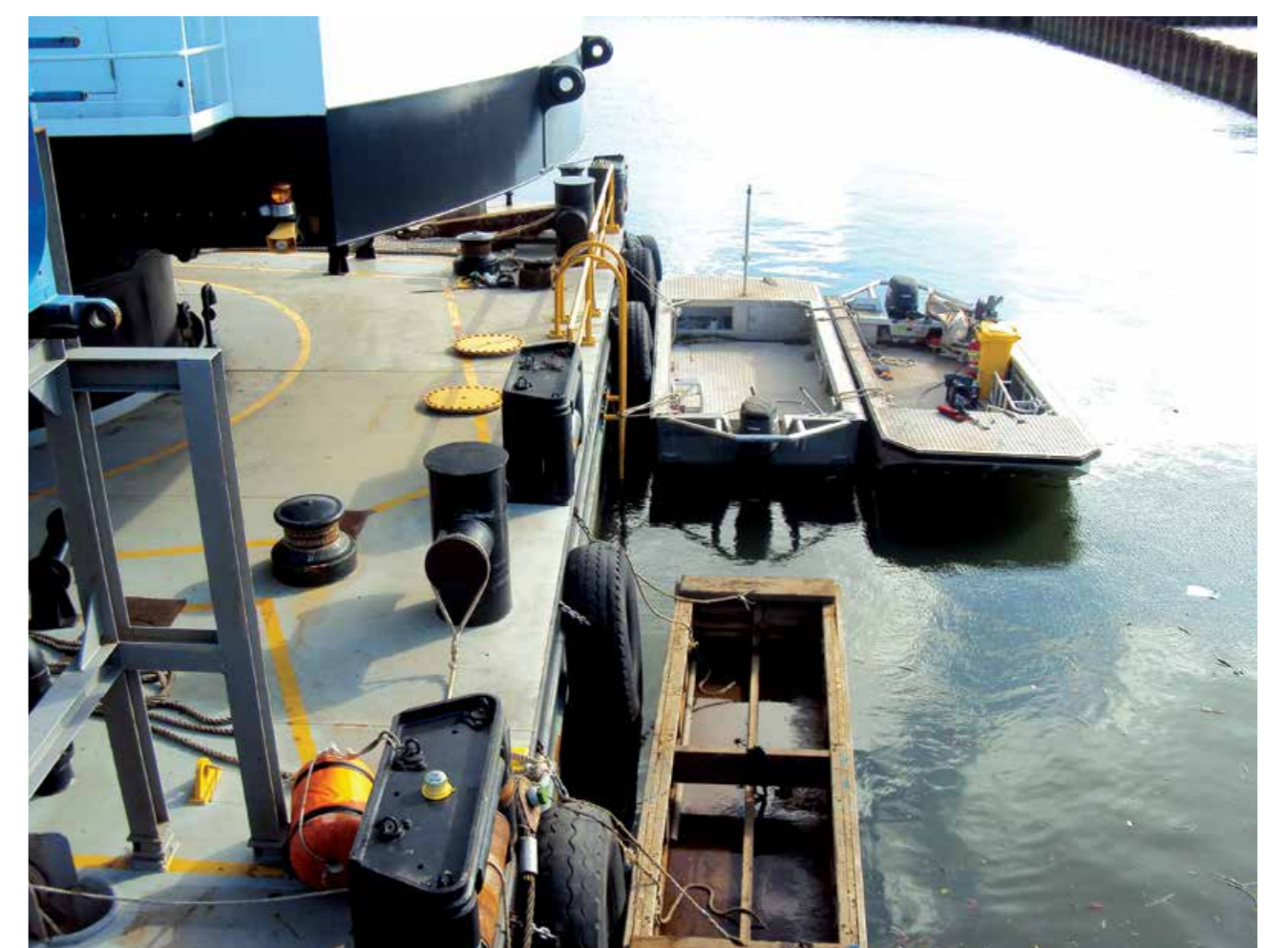
Small work boats tethered to a pontoon

A temporary construction site compound would be established for the duration of the project. The location would be identified and agreed with Council before construction starts. The area would be fenced off and restricted to authorised personnel and visitors.