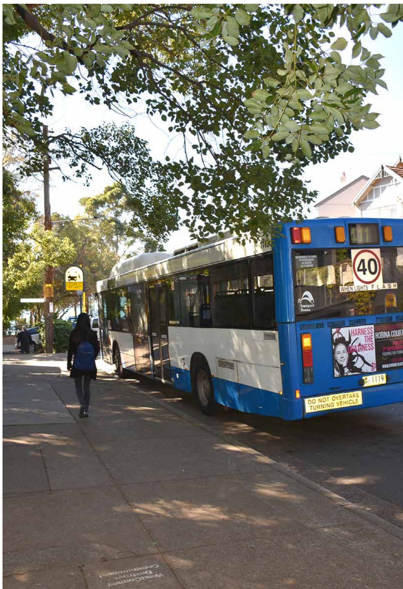
Bus stop at Grove Street

We encourage customers to plan their trip by visiting transportnsw.info or calling 131 500 before starting their journey. Customers would need to allow extra time for their journey.