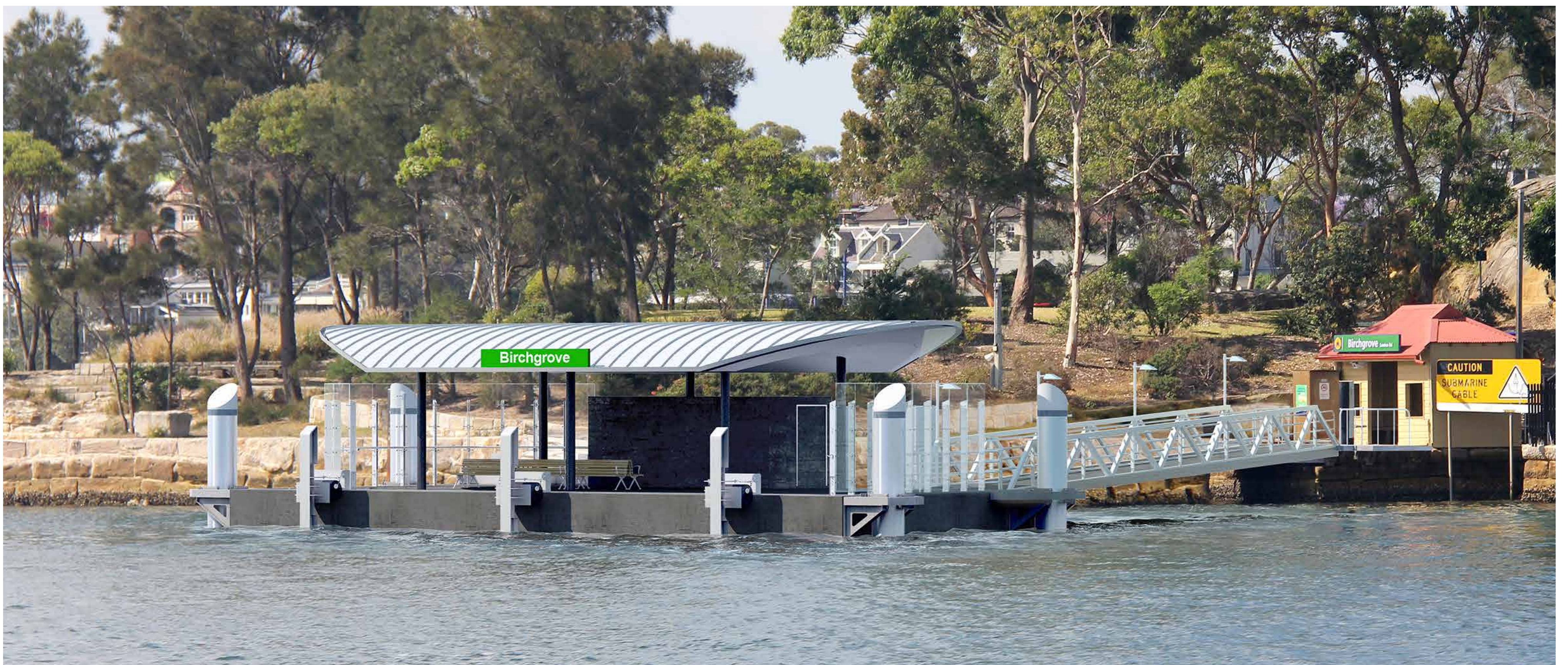
Artist's impression of the proposed new Birchgrove Wharf viewed from the river

The upgraded wharf is designed to provide customers with an improved public transport experience.