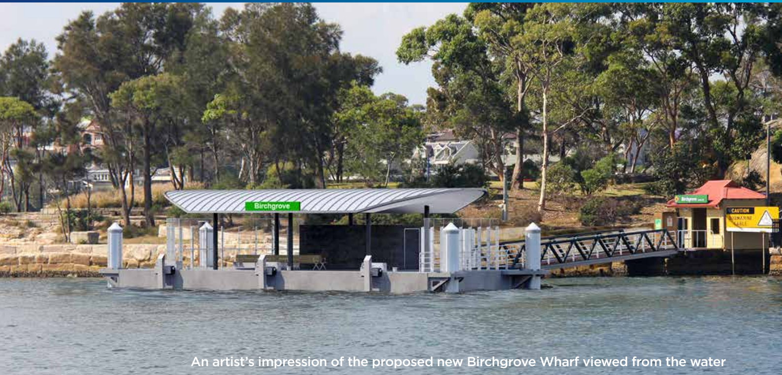
An artist's impression of the proposed new Birchgrove Wharf viewed from the water