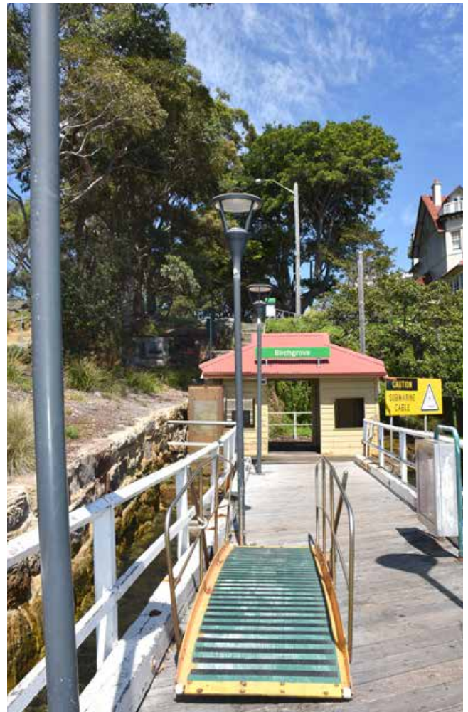
The existing Birchgrove wharf

Visit the Roads and Maritime Services website: rms.nsw.gov.au/wharfupgrades