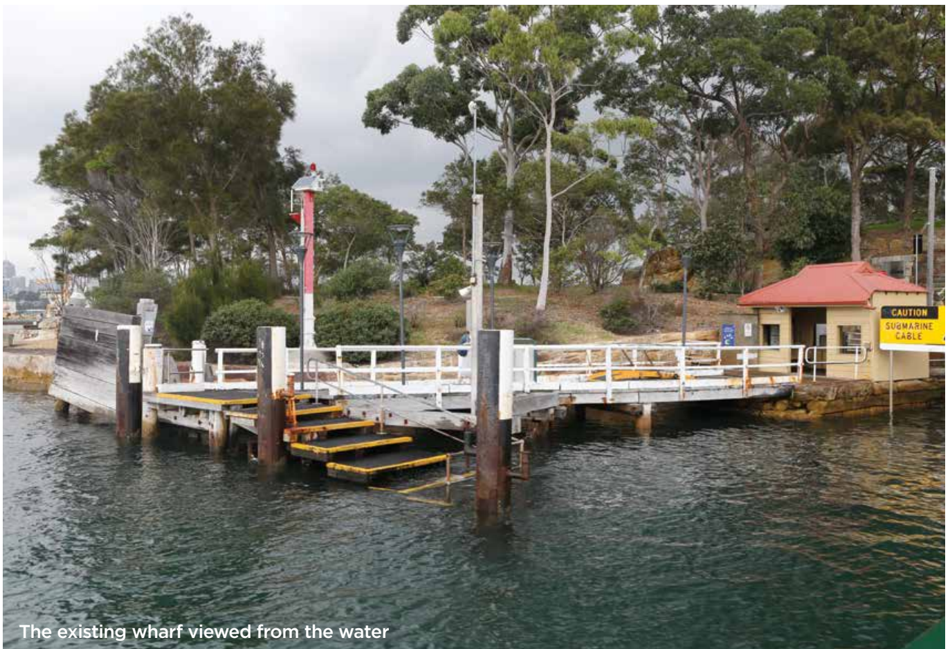
The existing wharf viewed from the water

Timing for the start of work will be advised when the planning process is complete and the Review of Environment Factors is finalised