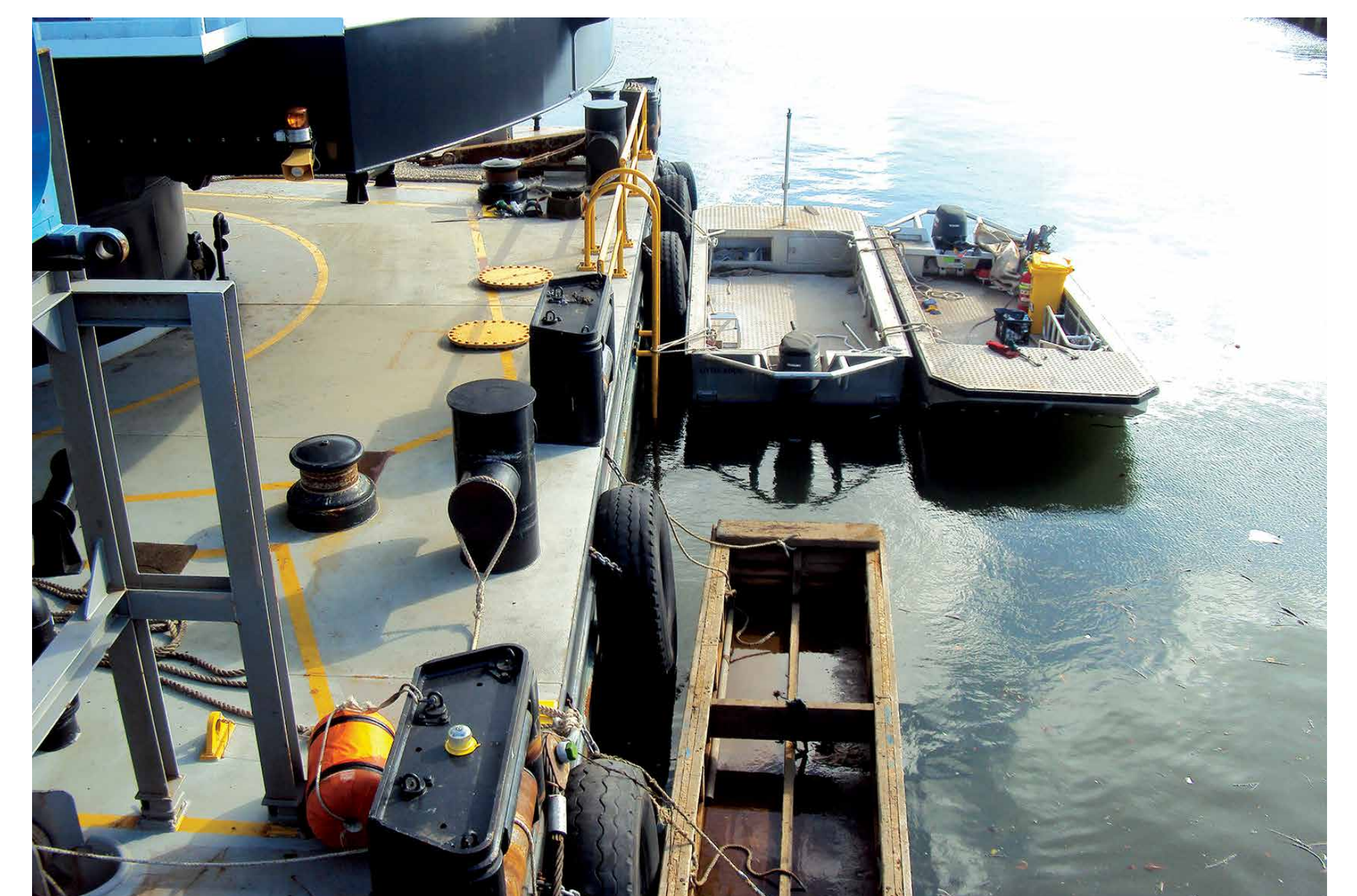
Small work boats tethered to a pontoon

A temporary construction site compound will be established for the duration of the project. The location will be identified and agreed with Council before construction starts. The area will be fenced off and restricted to authorised personnel and visitors.