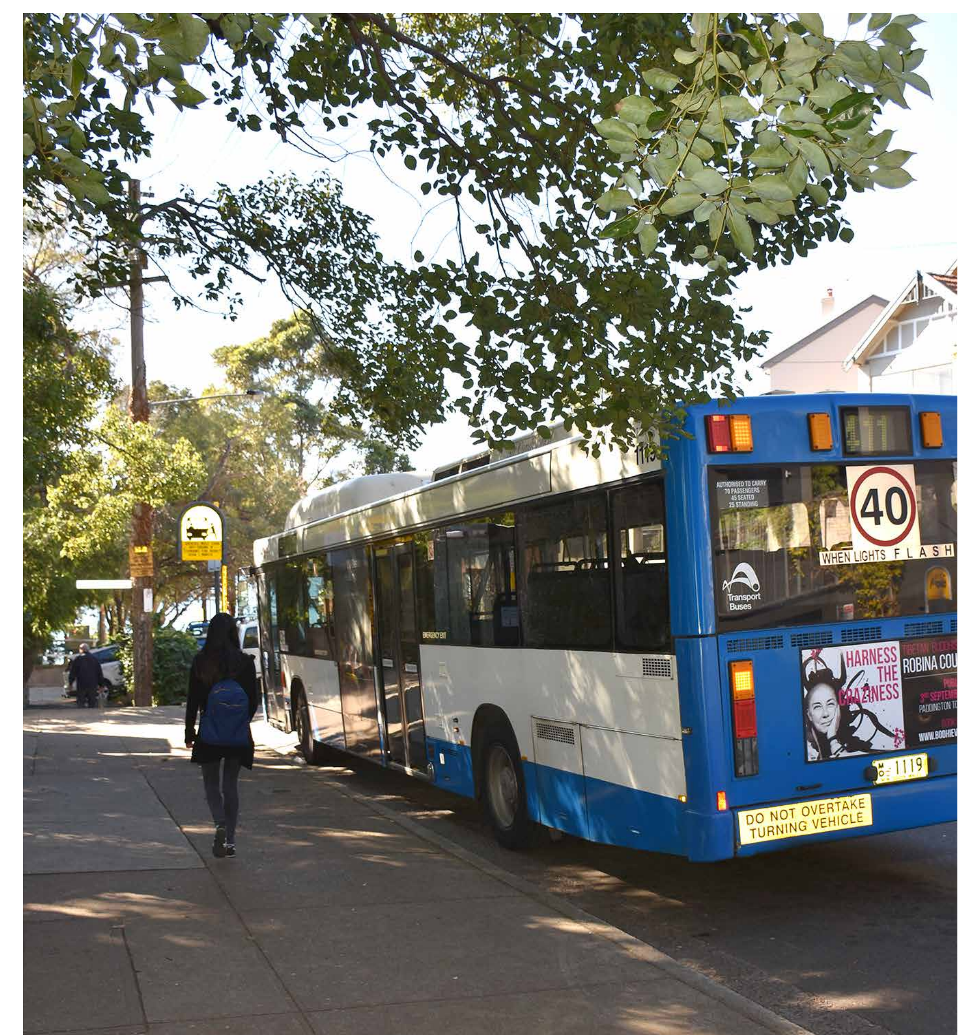
Bus stop on Grove Street