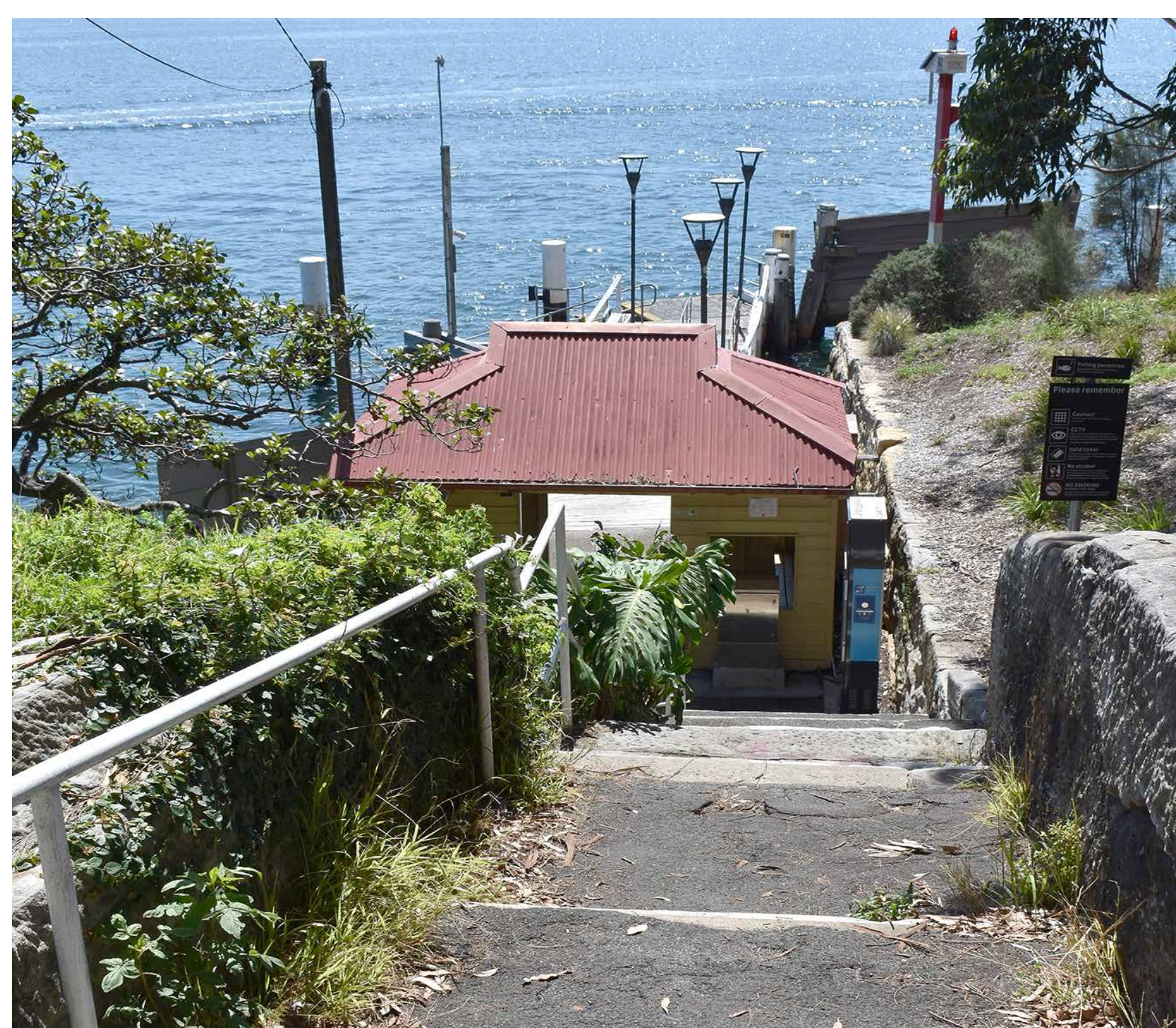
Steps down to existing wharf

Construction will start on Tuesday 17 October 2017 and will take about five months, weather and maritime conditions permitting.