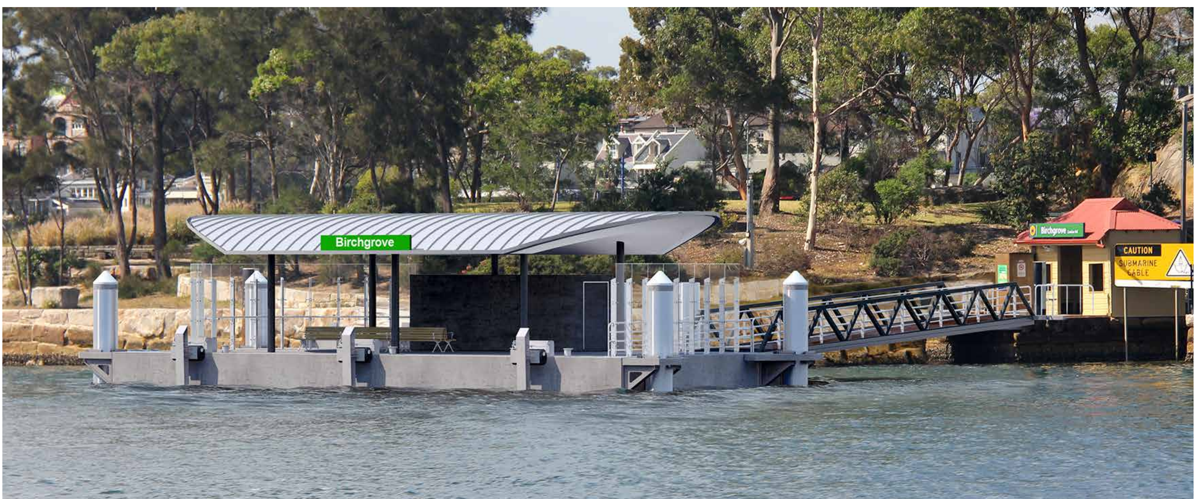
Artist's impression of the proposed new Birchgrove Wharf viewed from the river

The upgraded wharf is designed to provide customers with an improved public transport experience.