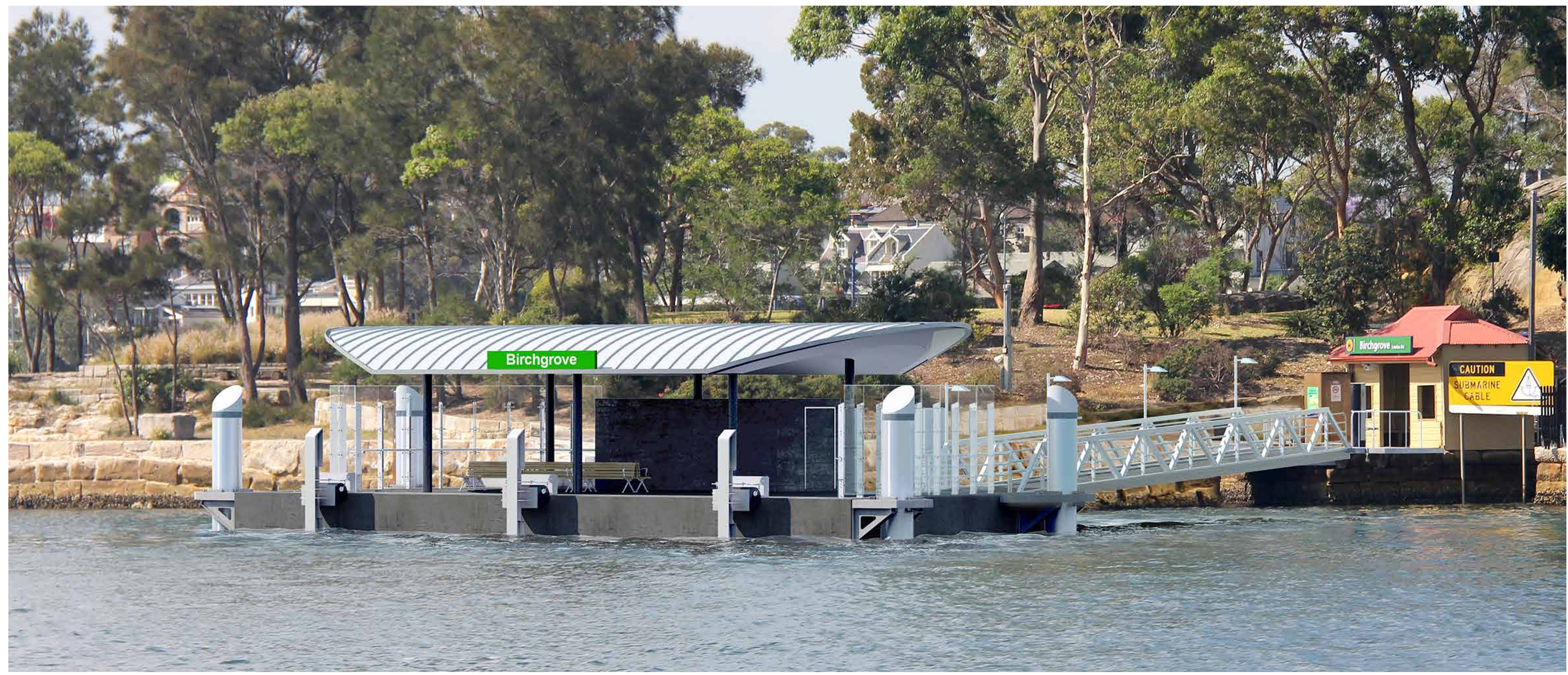
Artist's impression of the proposed new Birchgrove Wharf viewed from the river

The upgraded wharf is designed to provide customers with an improved public transport experience.