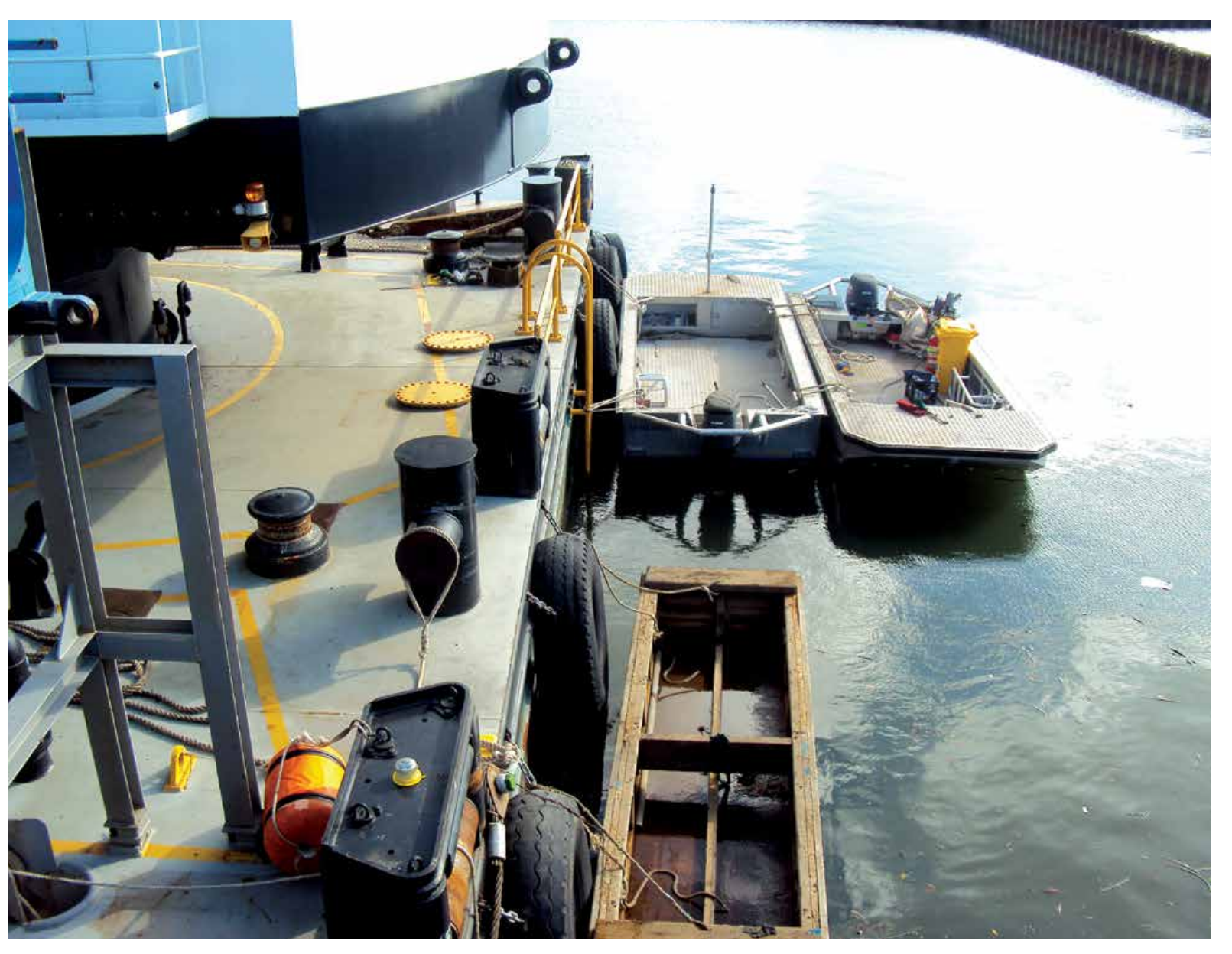
Small work boats tethered to a pontoon

You would be able to plan your trip by visiting transportnsw.info or calling Transport Info on 131 500. Customers would need to allow extra time for their journey.