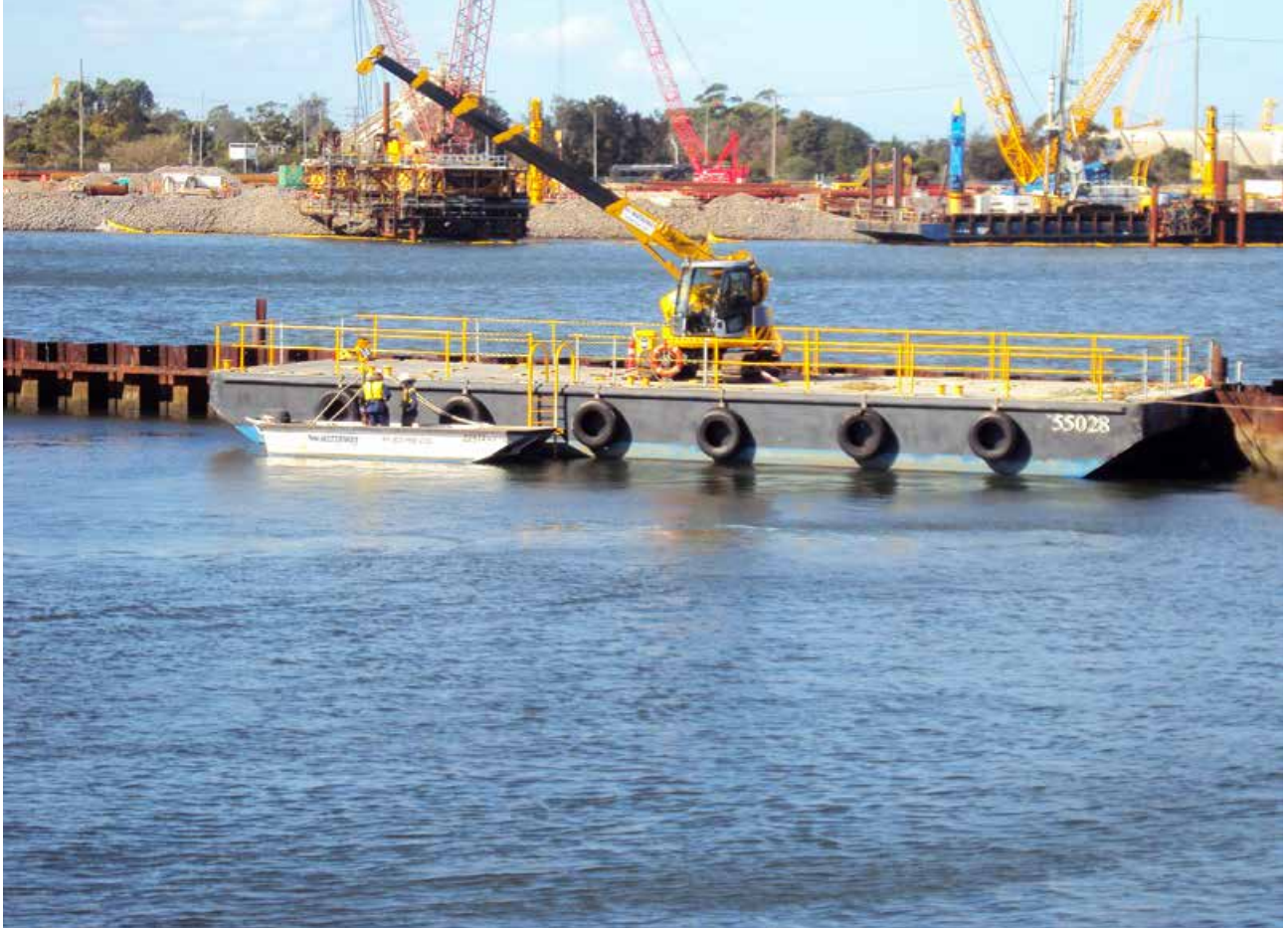
A service barge near a work site with equipment on board