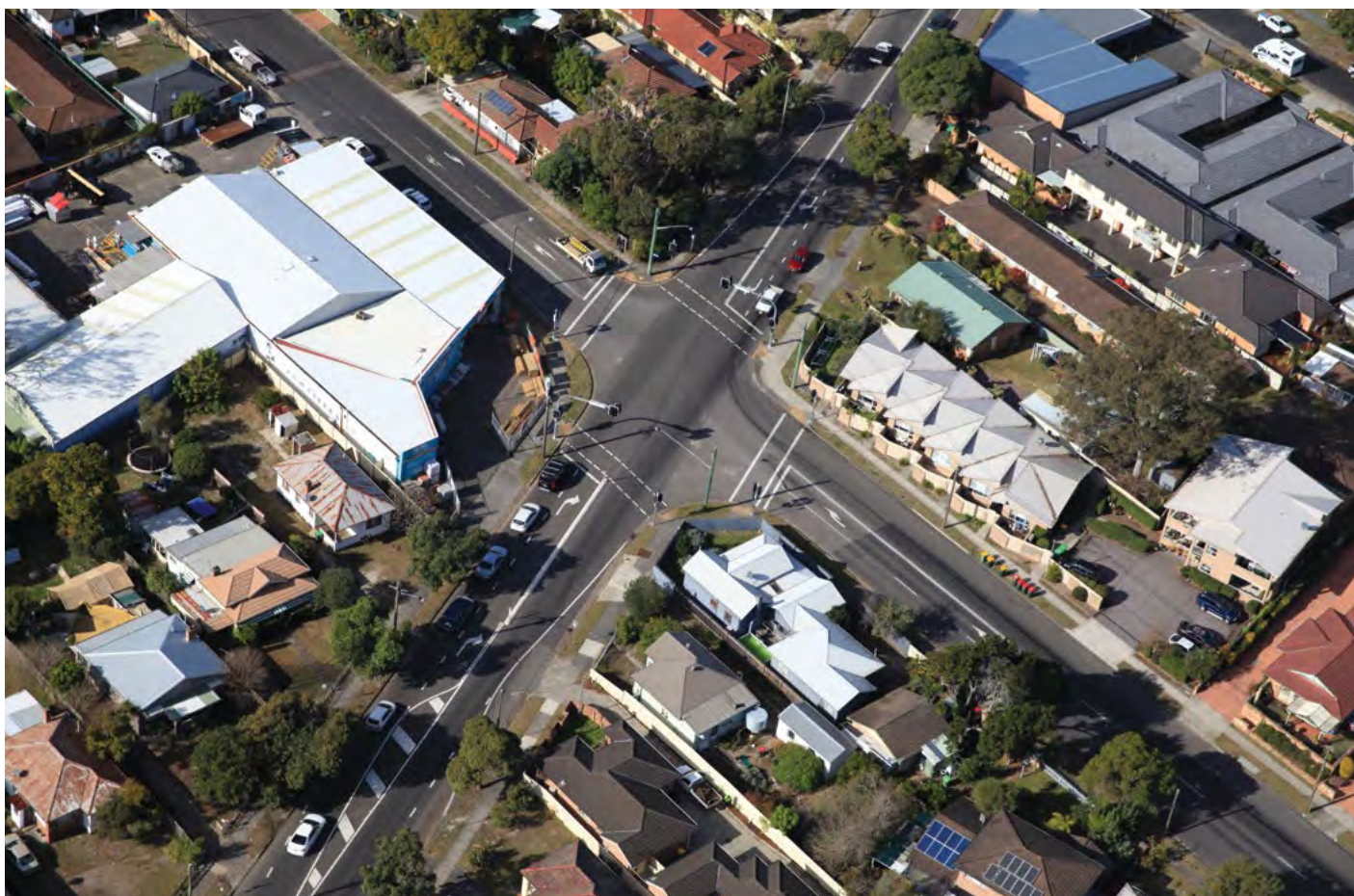
Allfield and Blackwall Road intersection

If you need help understanding this information, please contact the Translating and Interpreting Service on 131 450 and ask them to call us on 0243 946298 .