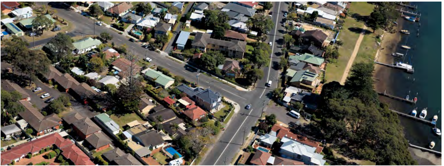
Blackwall Road and McMasters Road intersection