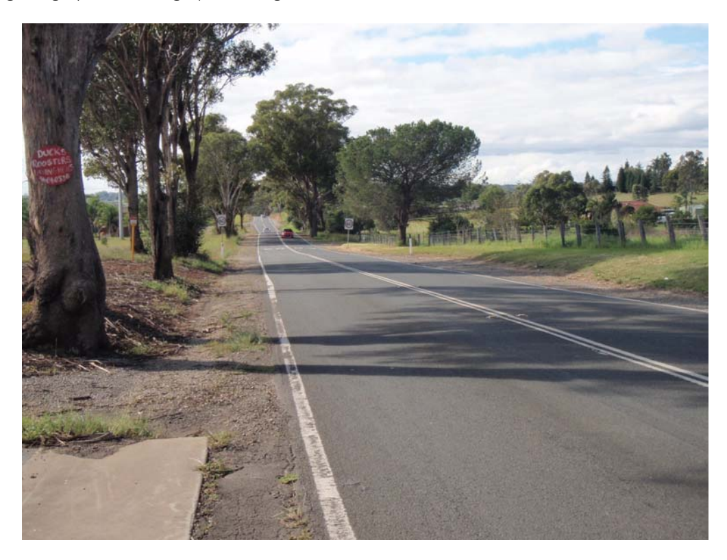
Existing Bringelly Road approaching Kelvin Park Drive travelling eastbound