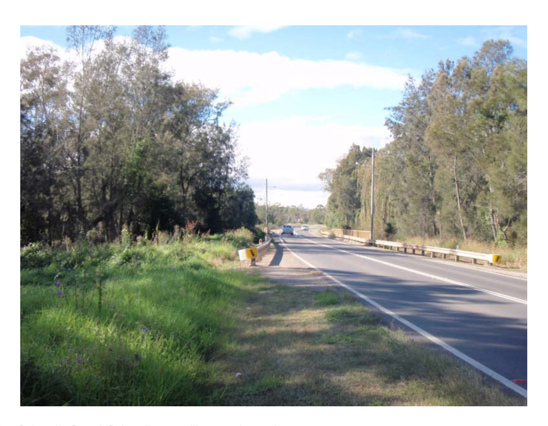
Existing Bringelly Road, Bringelly travelling eastbound