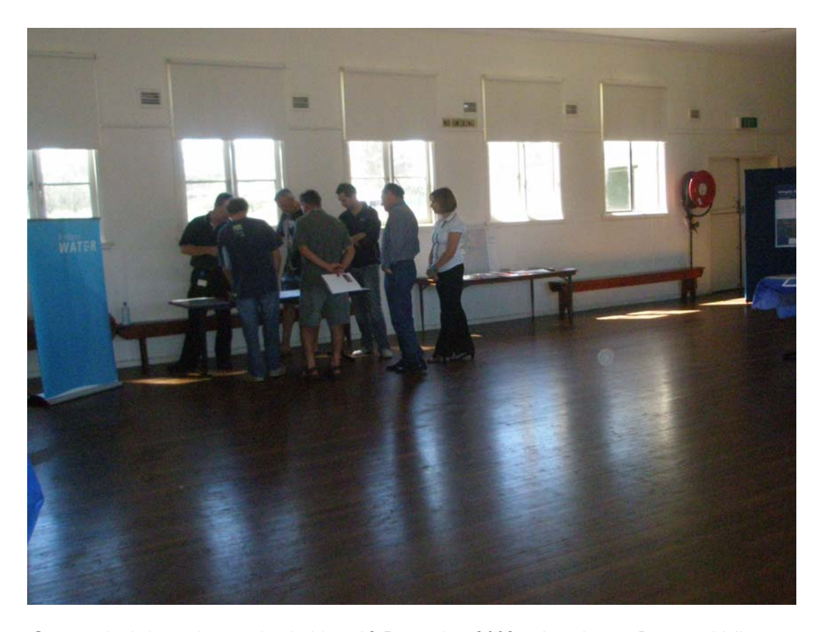
Community information session held on 19 December 2009 at Leppington Progress Hall