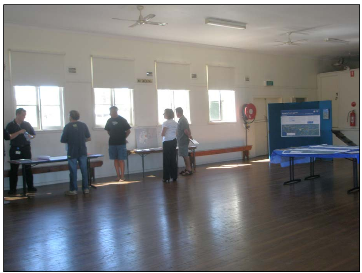
Community information session held on 3 November 2010 at the Leppington Progress Hall.