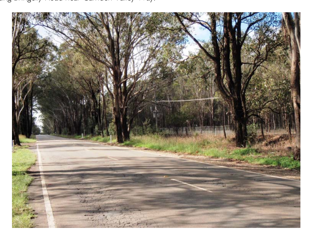
Existing Bringelly Road at Rossmore, view to the east.