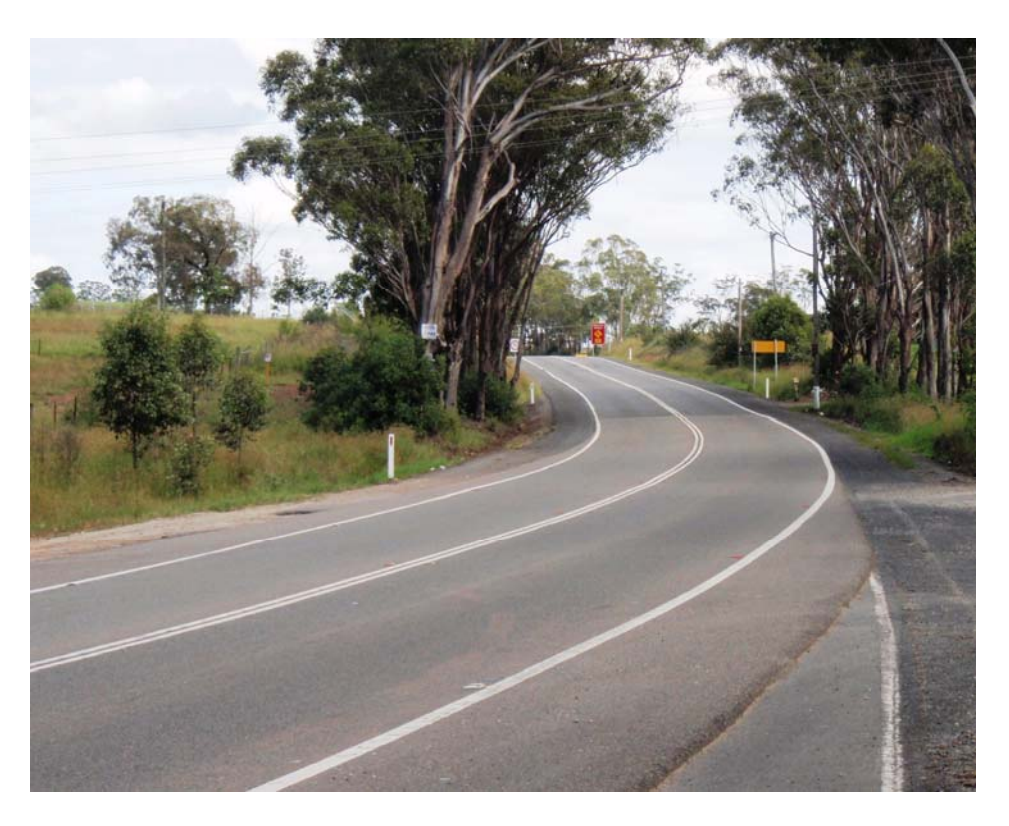
Existing Bringelly Road near Camden Valley Way.