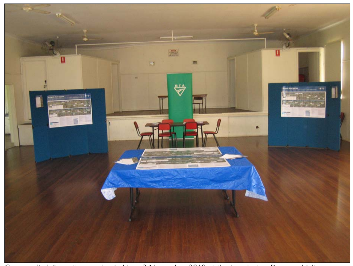
Community information session held on 3 November 2010 at the Leppington Progress Hall.