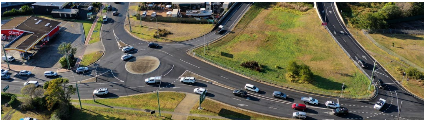
Roundabout at Memorial Drive and Princes Highway, Bulli

We will continue to work with Wollongong City Council to identify options to offset parking.