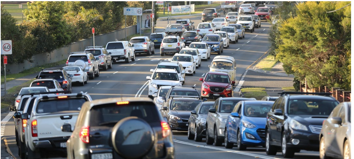
Congestion on the Princes Highway at Bulli

Transport for NSW has been developing options to improve the traffic efficiency and reliability of the Princes Highway at Bulli and Lawrence Hargrave Drive at Thirroul.