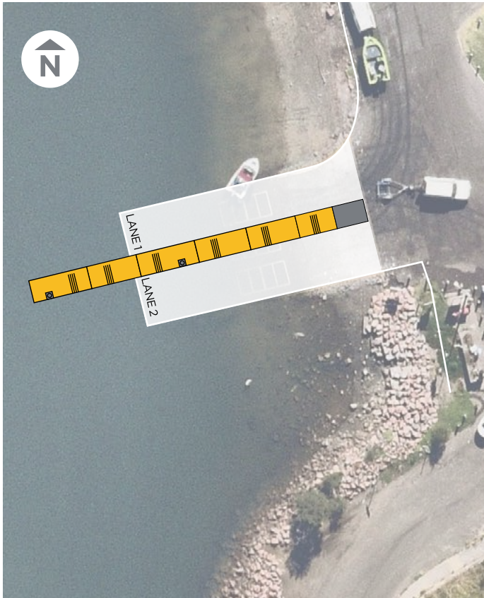
Figure 2 the pontoon

Subject to approvals, works are scheduled to commence in September 2020 and will take up to 8 weeks to complete, weather and sea conditions permitting. Construction hours will be from 7am to 6pm Monday to Friday and half day Saturdays as required. Seawall construction will not impact on boat ramp access, however the boat ramp will be closed for approximately two weeks during upgrade works to the ramp. You will receive a notification before work starts.