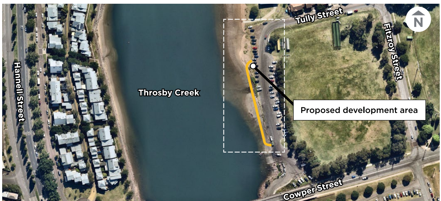
Figure 1 Carrington Foreshore Remediation work area